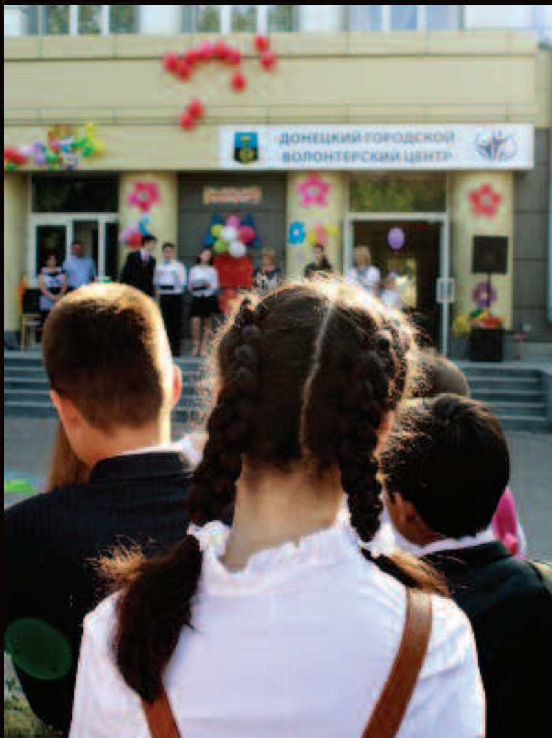
(above) The “First Bell” ceremony at School Number 2 in rebel-held Donetsk, marking the beginning of a new school year.

Human Rights Watch urges both Ukrainian authorities and Russia-backed militants to cease all attacks against schools that do not constitute military objectives and avoid deploying inside or adjacent to schools and kindergartens. Ukrainian authorities should deter the military use of schools by, among other things, endorsing the UN Safe Schools Declaration.