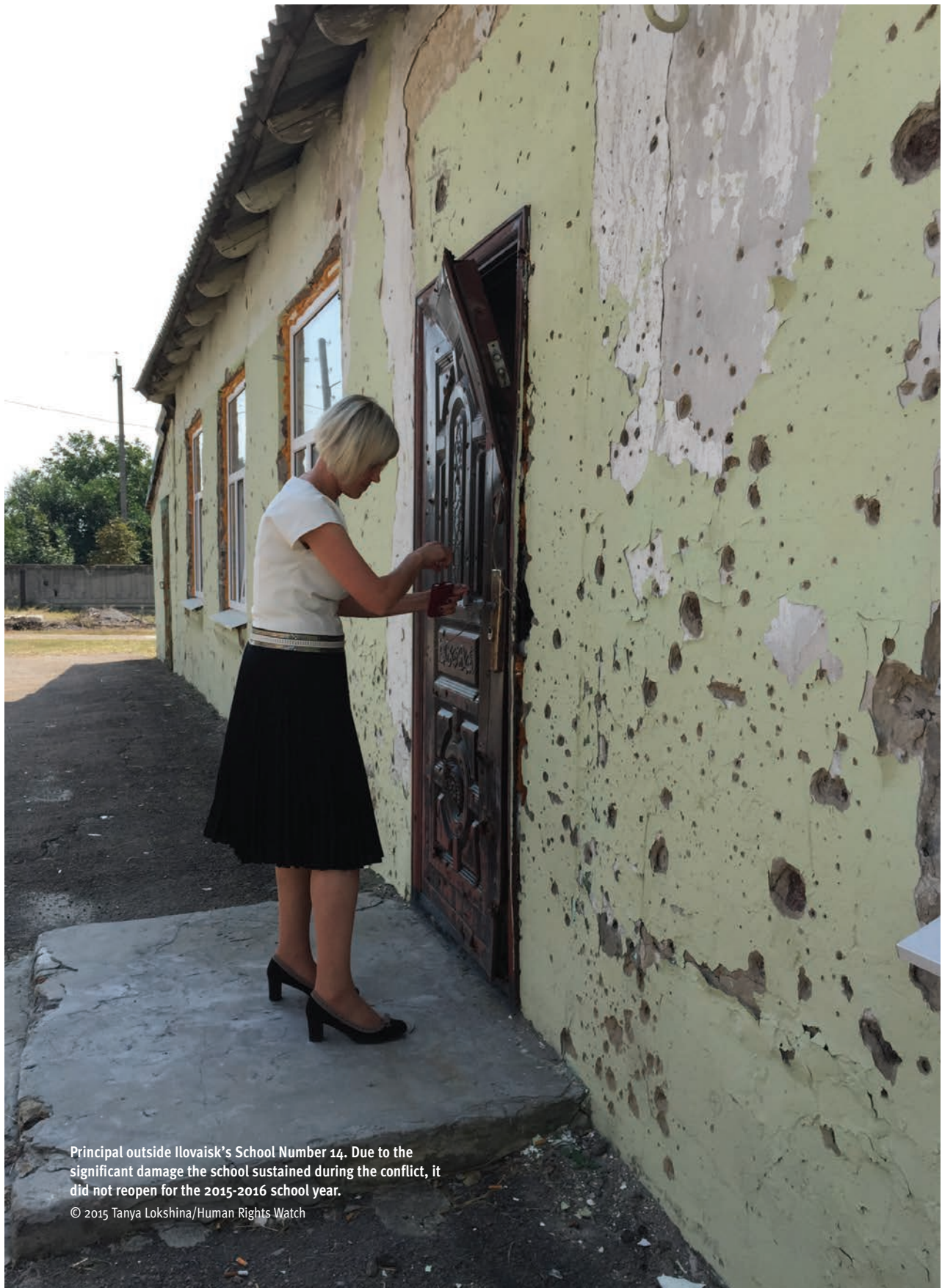
Principal outside Ilovaisk's School Number 14. Due to the significant damage the school sustained during the conflict, it did not reopen for the 2015-2016 school year.