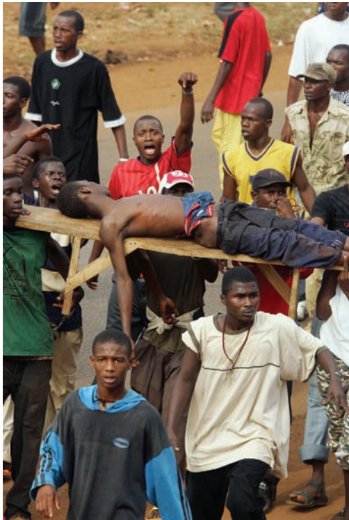
Protesters carry the body of a demonstrator who was killed by security forces during a demonstration on January 22, 2007 in which tens of thousands of Guineans in the capital city of Conakry attempted to march to the National Assembly building. The individual pictured here was one of at least 129 killed by security forces during the January and February, 2007 strike violence.

“command responsibility” enables military commanders and others in positions of authority to be held criminally liable when crimes are committed by forces under their effective command and control, when they should have known about the crimes, and when they fail either to prevent the crimes or prosecute those responsible. Guinea’s current penal codes are not adequately developed with respect to these international and human rights law concepts, presenting an additional judicial challenge for September 2009 accountability trials.