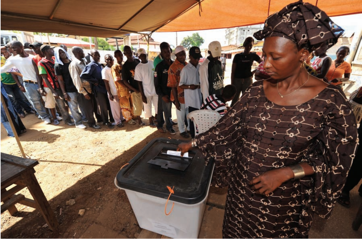
A woman casts her vote at a polling station in Conakry on November 7, 2010.

Corruption within both the public and private sectors in Guinea has long been endemic. From the petty corruption and bribe-solicitation perpetrated by frontline civil servants to the extortion, embezzlement and illicit contract negotiations that take place in the shadows, those involved in bribery and various forms of corruption are rarely investigated, much less held accountable. Guinea's past rulers have also largely mismanaged, embezzled, and squandered the proceeds from the country's abundant natural resources, thereby denying the majority of the population access to even the most basic health care and education. As a result, Guinea is one of the world's poorest countries and suffers some of the world's highest rates of infant and maternal mortality and adult illiteracy, despite its natural resources.