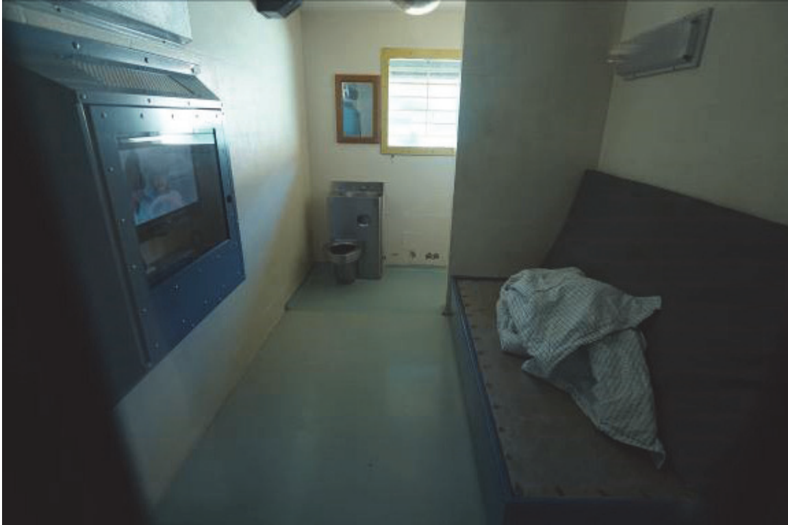
A solitary confinement cell located in the safety unit of Brisbane Women's Correctional Centre in Queensland. The cells are designed with CCTV cameras; no ligatures, hooks, or sharp edges; furnishings are bolted to the ground or flush to the wall to minimize risk of self-harm.