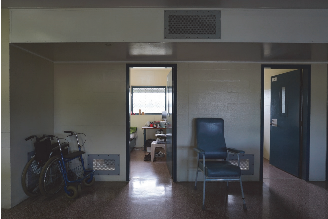
A wheelchair outside a room in Wolston Correctional Centre, Queensland. Many prisons are not fully accessible, making it extremely difficult for people with physical or sensory disabilities to navigate.

Lack of shower chairs, designed to assist people with physical disabilities, also means that people have to wait hours to use one, must use their own wheelchair, or in some cases go without showers.