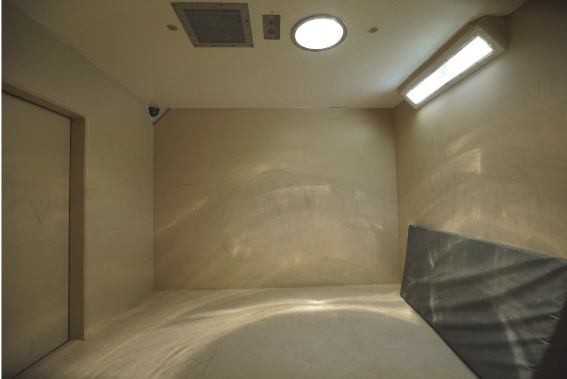
A padded cell in Brisbane Women's Correctional Centre, Queensland. Human Rights Watch documented at least three cases of female prisoners who were kept in windowless, perpetually lit, padded cells for several consecutive days, and in one case for over a month.

The stress of a closed and heavily monitored environment, absence of meaningful social contact, and lack of activity can exacerbate mental health conditions and have long-term adverse effects on the mental well-being of people with psychosocial or cognitive disabilities. All too frequently, people with psychosocial or cognitive disabilities can decompensate in solitary confinement, attempting suicide or requiring emergency psychosocial support or psychiatric hospitalization.