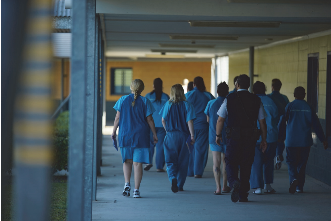
Female prisoners walking in the Brisbane Women’s Correctional Centre, Queensland. The prison has capacity for about 250 prisoners but is routinely overcrowded.