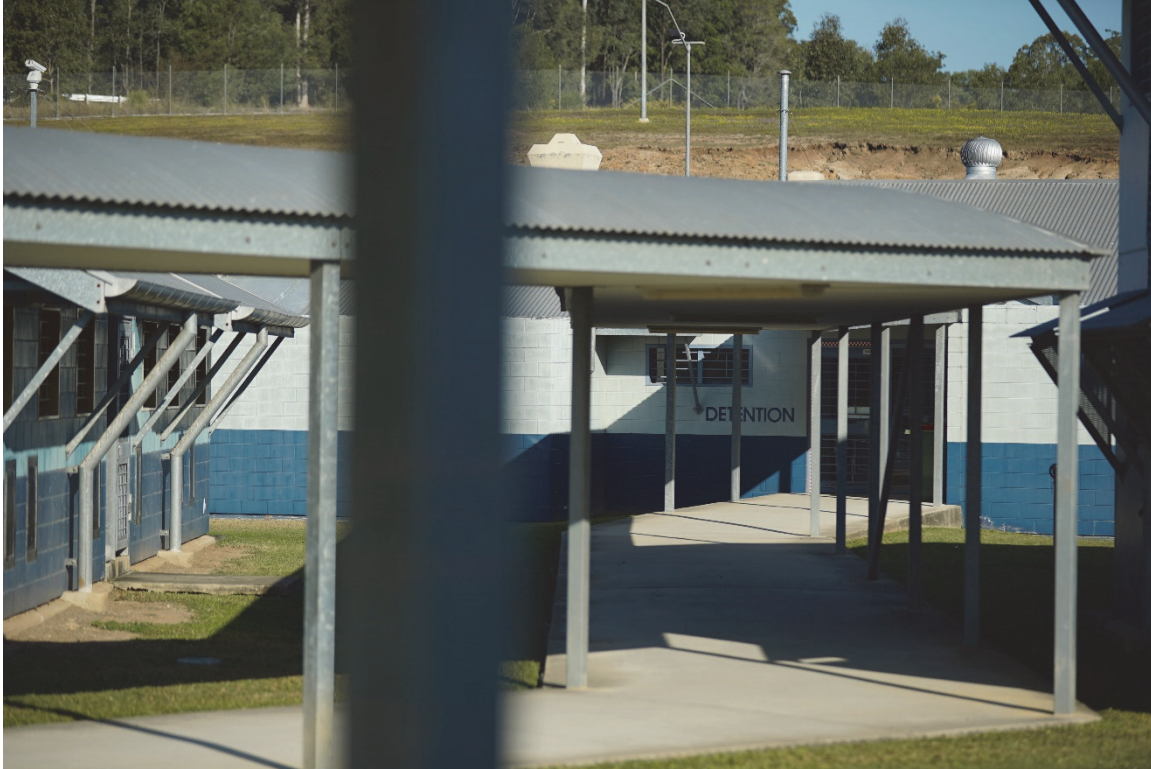
A view of the detention unit in Brisbane Women’s Correctional Centre, Queensland. Prisoners in such cells lose privileges, such as access to work or leisure activities, and are let into an exercise yard for two hours a day at most.

conducted through closed cell doors, allowing for the response to be heard across the unit, including by prison guards.