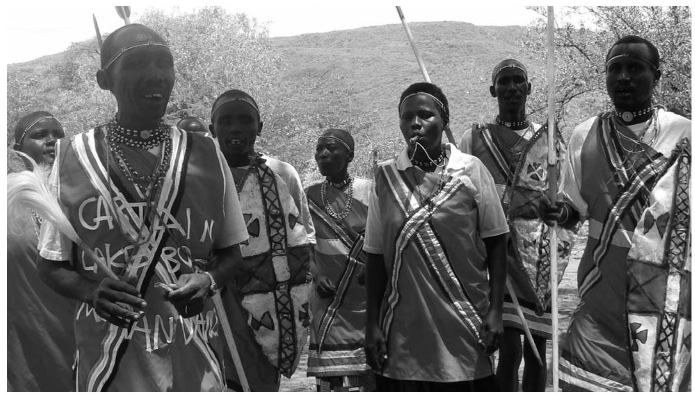
Members of Kenya's pastoralist Endorois community.

MRG and Kenyan non-governmental organization Centre for Minority Rights Development (CEMIRIDE) lodged a complaint with the African Commission in 2003, claiming that the Kenyan government had violated the African Charter by failing to recognize and protect