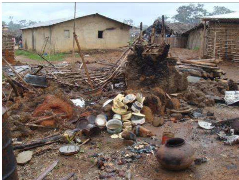
Rubble in the village of Gobroko, June 2011

Between 5-9 May 2011, five fairly remote villages in the Sassandra region (some 200 km south-west of Abidjan) were the scene of serious violations of international humanitarian law and grave human rights abuses. More than 200 people were killed, most of them unarmed civilians, and dozens of houses were burned and looted. At least 1,000 people were left displaced as a result.