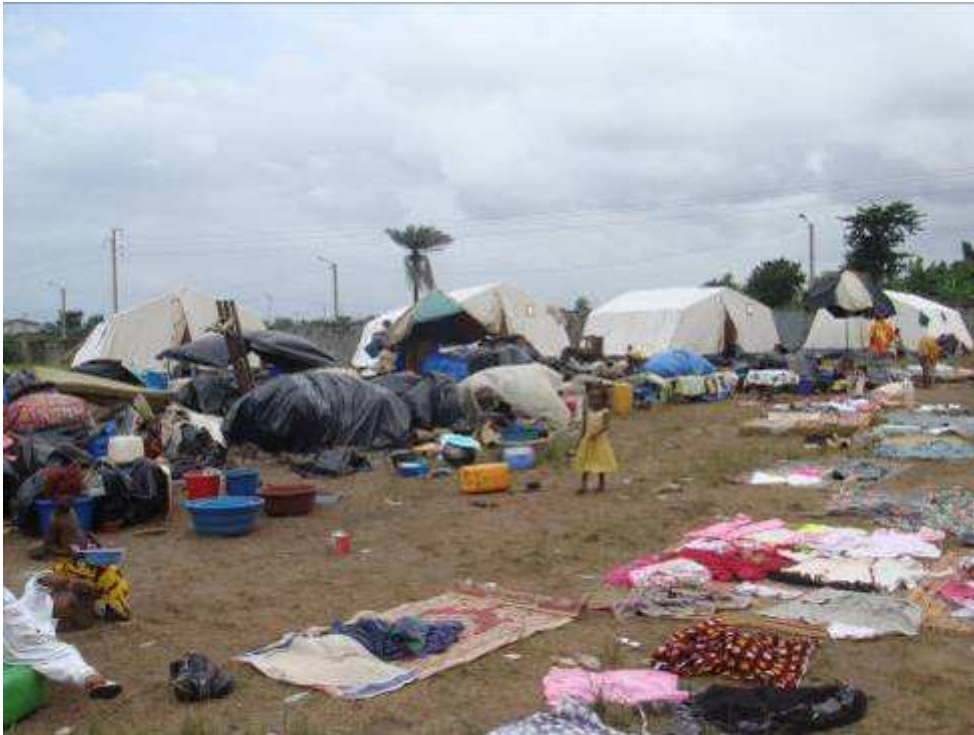
Displaced people site at St. Laurent Catholic Church in Abidjan, June 2011

As a result, rates of return have slowed dramatically and, in some locations, there has been renewed displacement. For instance, the number of displaced people living in the grounds of the Catholic Mission of Our Lady of Nazareth in Guiglo, has increased from 3,376 at the time of a census carried out on 10 May, to more than 4,000 one month later. 13 In June, Amnesty International visited numerous villages in western Côte d’Ivoire, particularly between the towns of Guiglo and Bloléquin, to which as many as 60-75 per cent of the Guéré population – generally perceived to have been loyal to Laurent Gbagbo - had not yet returned. For instance, by 11 June 2011, about 12,000 individuals were still living in the grounds of the Catholic Mission in Duékoué (about 500 km to the west of Abidjan). Recognizing that the prospect of many of those people returning to their villages seems increasingly distant, UNHCR has decided to build a formal site to which they would be transferred. By mid-July 2011, two blocks of housing were complete and some 800 displaced people had been transferred to the new site. During its visit to this area, Amnesty International also learned that rates of return of Ivorian refugees from Liberia had slowed dramatically as well.