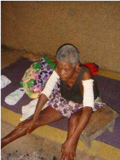
75 year old woman injured when her house was burned in Abébé on 7 May 2011

“It was a nightmare. Suddenly our house was being attacked. I think it started on the Saturday night [7 May 2011]. A group of Dozos had come and they said they wanted to kill all the Godié. I was trapped here in my house with two of my children. Both were shot dead. They set our house on fire and I was very badly hurt. I somehow survived. I have only recently come back from the hospital. I have not seen my husband since. People tell me that his throat was slit by Dozo fighters who caught him while he was trying to hide in the forest.”