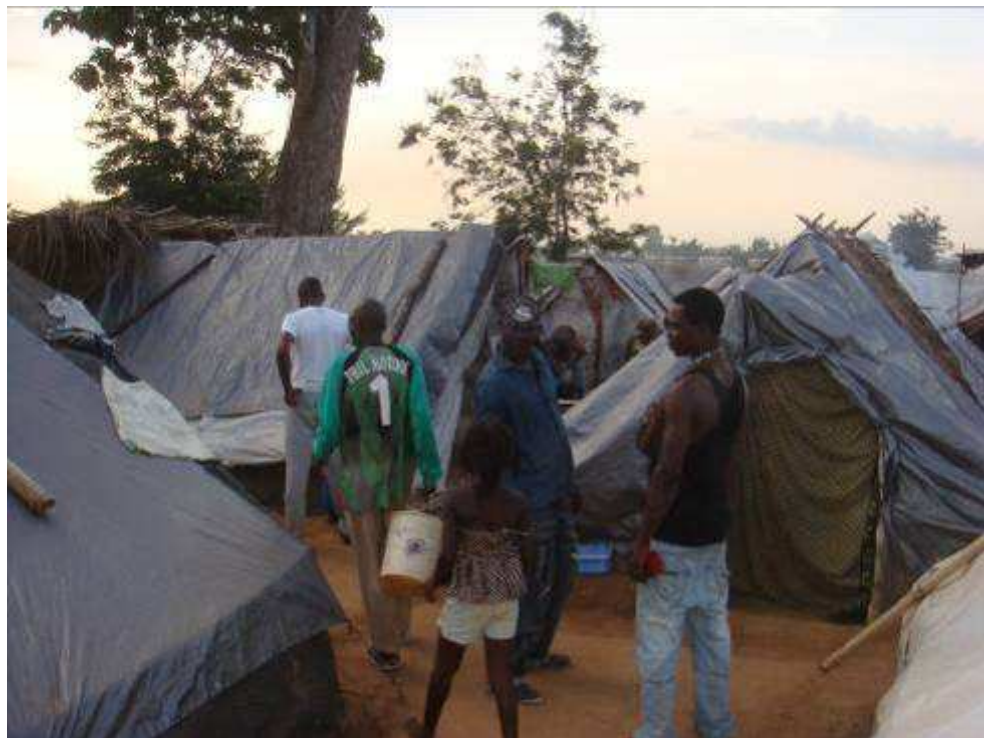
Liberian Refugee Camp, Guiglo, June 2011

Liberian refugees have been targeted for widespread reprisal attacks, particularly after the 2002 armed uprising and again since the resumption of the violence after the November 2010 presidential election, largely because some Liberians were recruited as mercenaries at different times during the last decade by all the parties to the conflict. These mercenaries have been responsible for crimes under international law and serious human rights abuses. During each of the three fact-finding visits to Côte d’Ivoire since the beginning of 2011, Amnesty International has interviewed numerous Liberian refugees among a group of 600 in a camp beside the UNOCI base in the town of Guiglo, in the west of the country. One leader of the community told Amnesty International in June that: