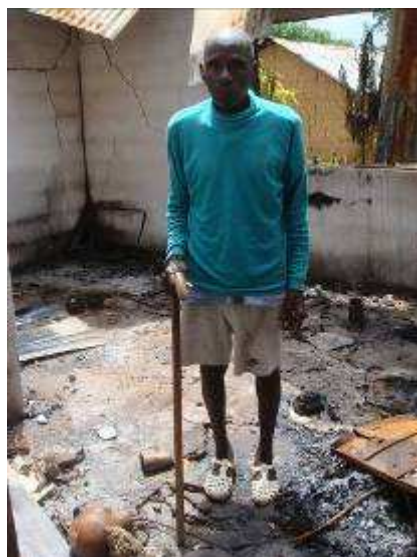
81 year old man in remains of his house burned in Gobroko on 9 May 2011