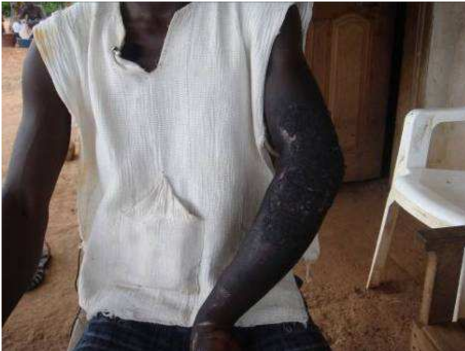
Scarred arm of man tortured and burned by FRCI in Duékoué on 20 May 2011

People were also tortured by the FRCI. One 38-year-old man described to Amnesty International how he was tortured on 20 May 2011 in Duékoué, and showed his injuries to the delegation: “The FRCI tied me to a tree, tied a mattress around me and set the mattress on fire. The flames burned through the ropes holding the mattress to my body and I then fell to the ground. But my left arm was badly burned.”