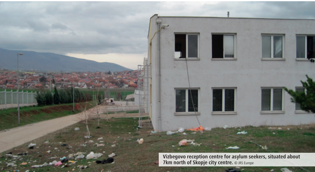
Vizbegovo reception centre for asylum seekers, situated about 7km north of Skopje city centre.

For those who do stay and claim asylum in Macedonia, the process can be long and uncertain. And it involves living in difficult material conditions in Macedonia's reception centre at Vizbegovo. The reception centre was opened in June 2008. Early photographs and reports indicate that the centre was initially in good condition, and for some time was kept clean and well maintained. A European