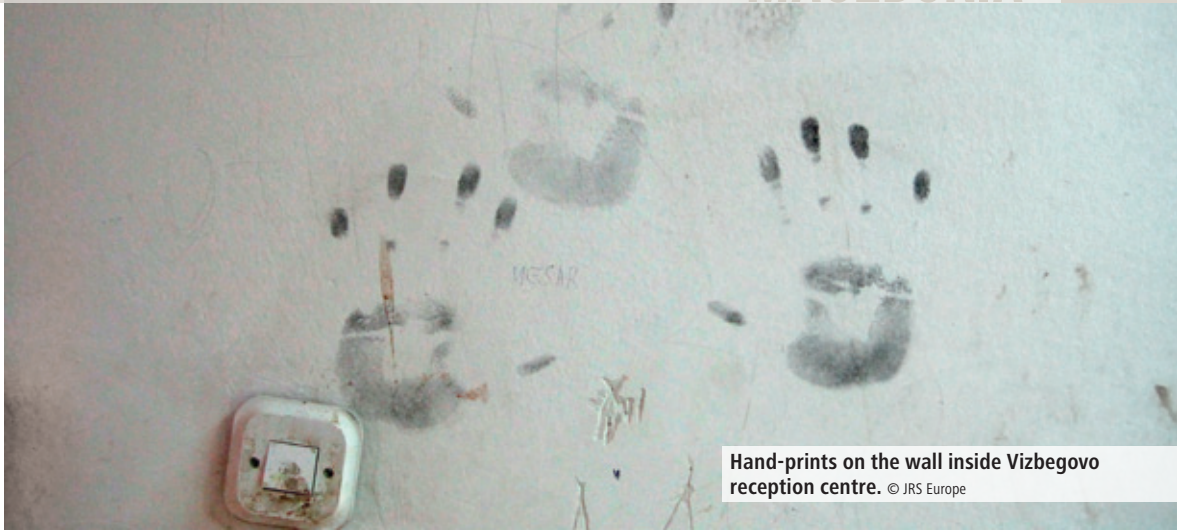
Hand-prints on the wall inside Vizbegovo reception centre.