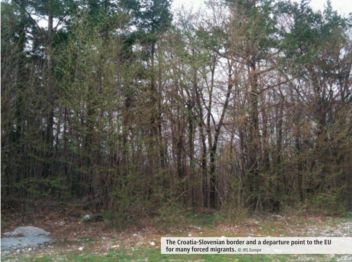
The Croatia-Slovenian border and a departure point to the EU for many forced migrants.

bit one of them and managed to escape, dragging himself to a local hospital for emergency care. He was subsequently so terrified for his safety that he decided to leave South Africa and seek asylum in Europe.