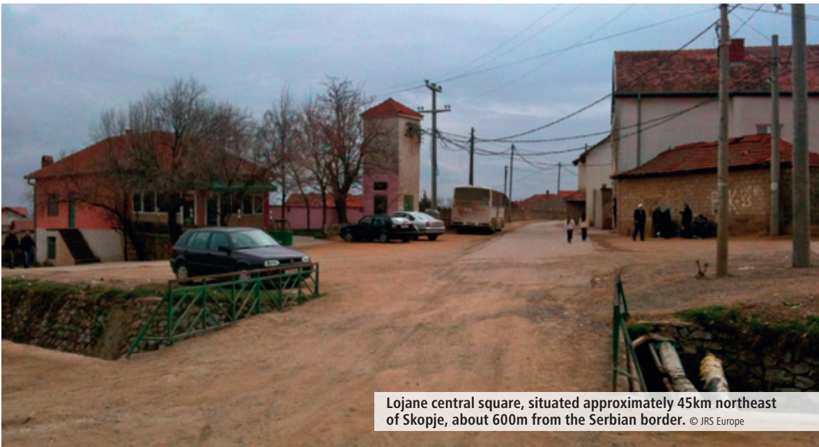
Lojane central square, situated approximately 45km northeast of Skopje, about 600m from the Serbian border.

For most migrants, including asylum seekers, Macedonia is a country of transit rather than a final destination. The fact that Macedonian authorities have not granted any asylum claims in 2011