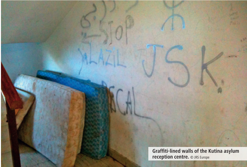
Graffiti-lined walls of the Kutina asylum reception centre.