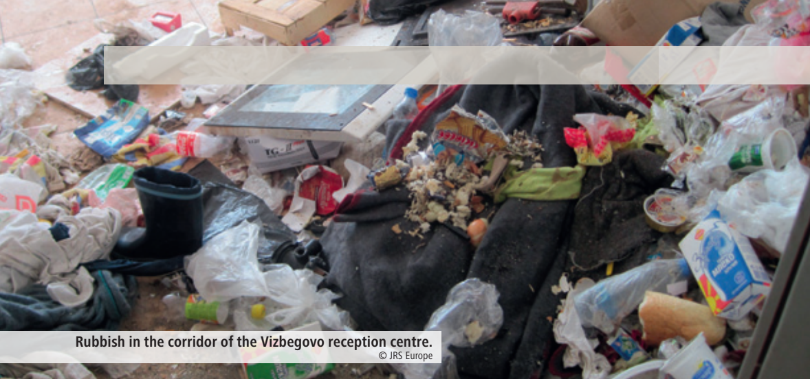
Rubbish in the corridor of the Vizbegovo reception centre.