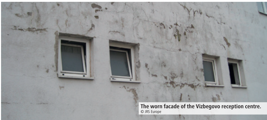
The worn facade of the Vizbegovo reception centre.

The situation of the Doe family is complicated by the fact that while one of