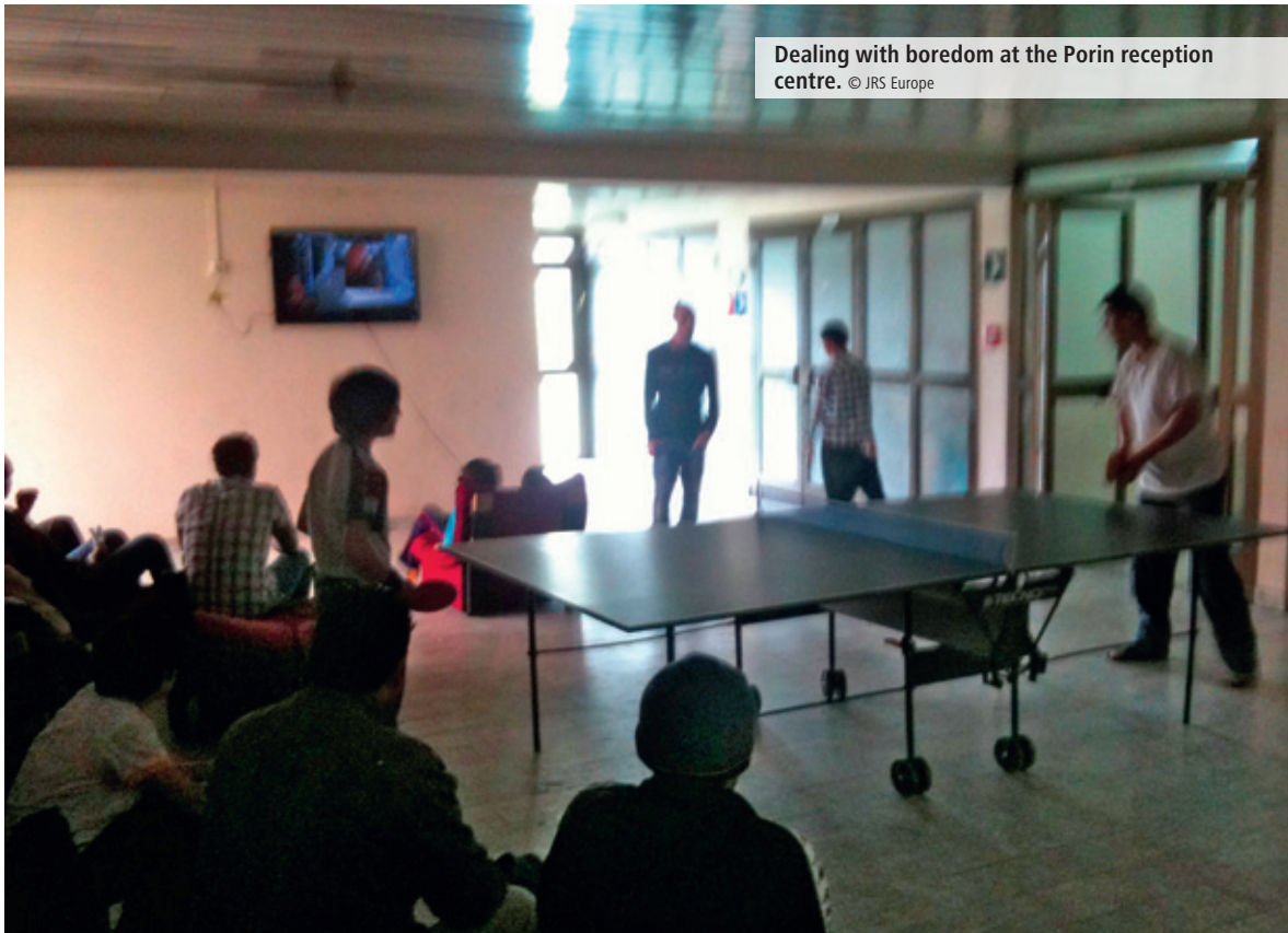
Dealing with boredom at the Porin reception centre.