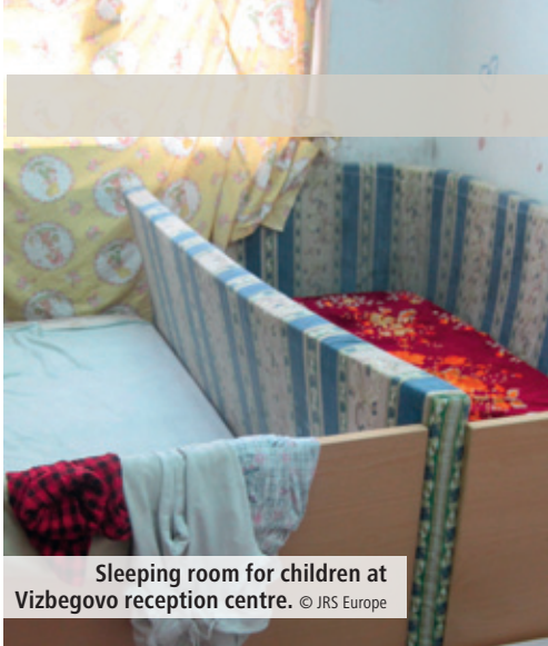
Sleeping room for children at Vizbegovo reception centre.