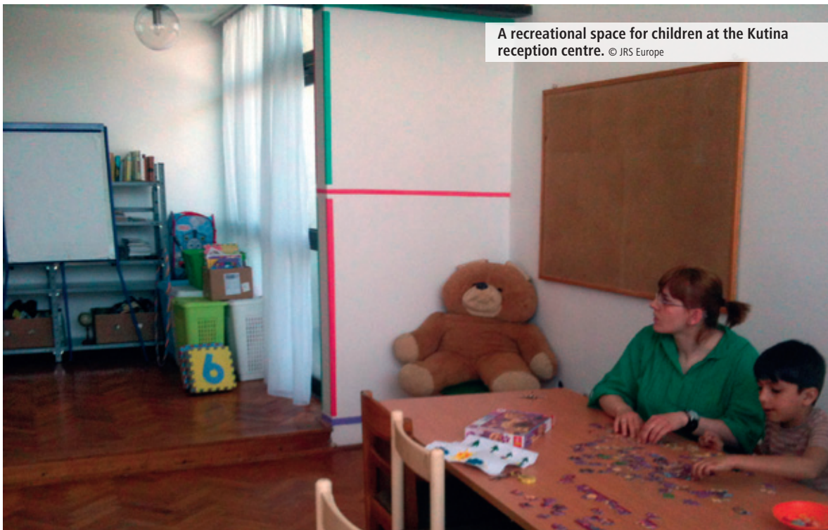
A recreational space for children at the Kutina reception centre.

Given the number of minors passing through the Croatian asylum system it is important to establish proper recreation, education and care programs for children, and to ensure that their particular needs are met. While there is a clean and well-staffed kindergarten at the reception centre at Kutina there are no properly organised activities or programs for school-aged children which might occupy their time.