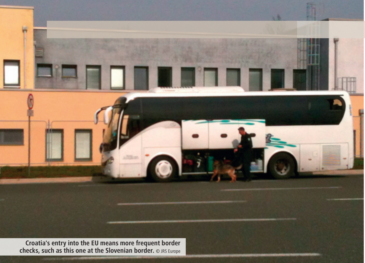
Croatia's entry into the EU means more frequent border checks, such as this one at the Slovenian border.