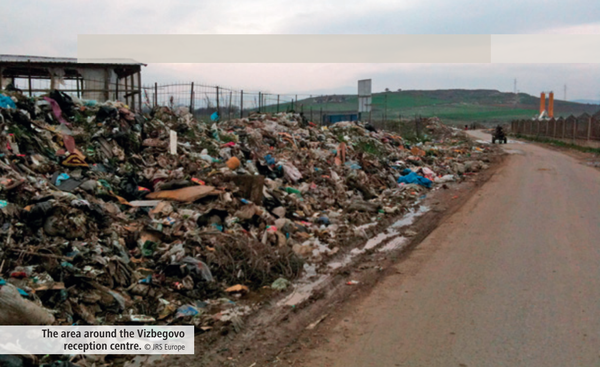
The area around the Vizbegovo reception centre.

Commission report published in 2011 found that while certain services to the reception centre residents were lacking, living conditions in the centre were “satisfactory”. 6