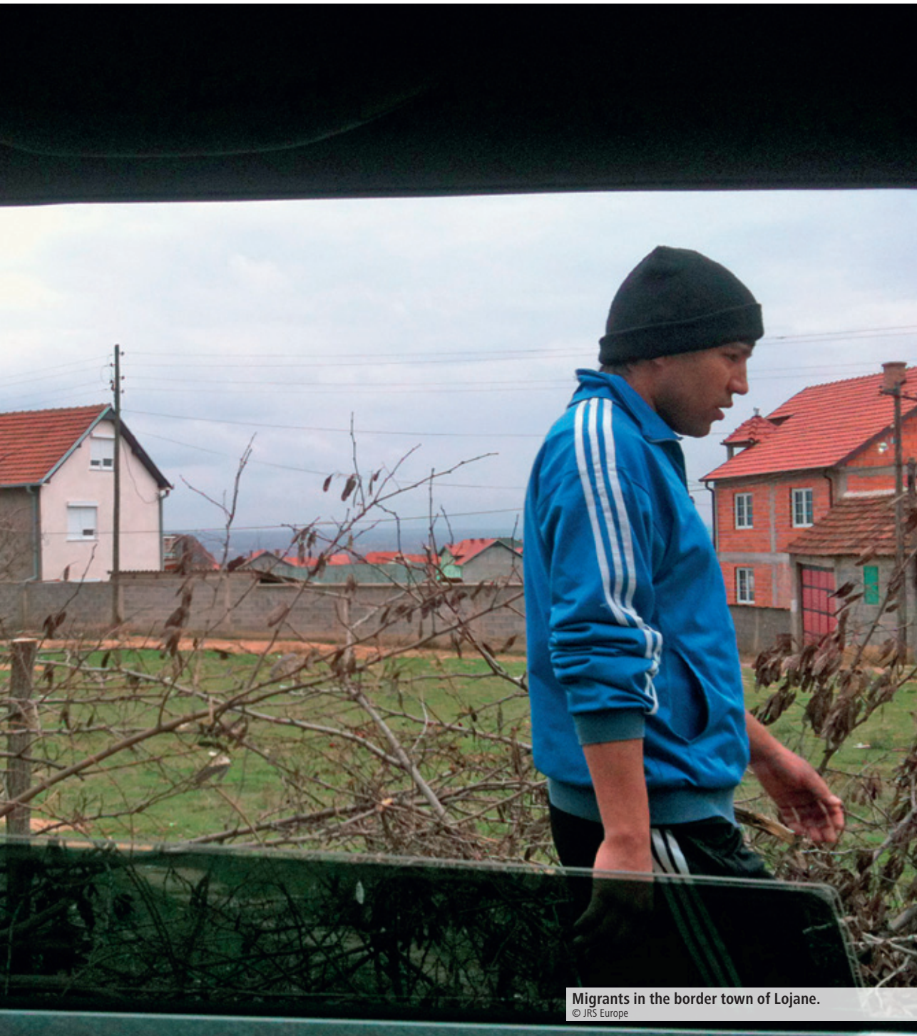
Migrants in the border town of Lojane.