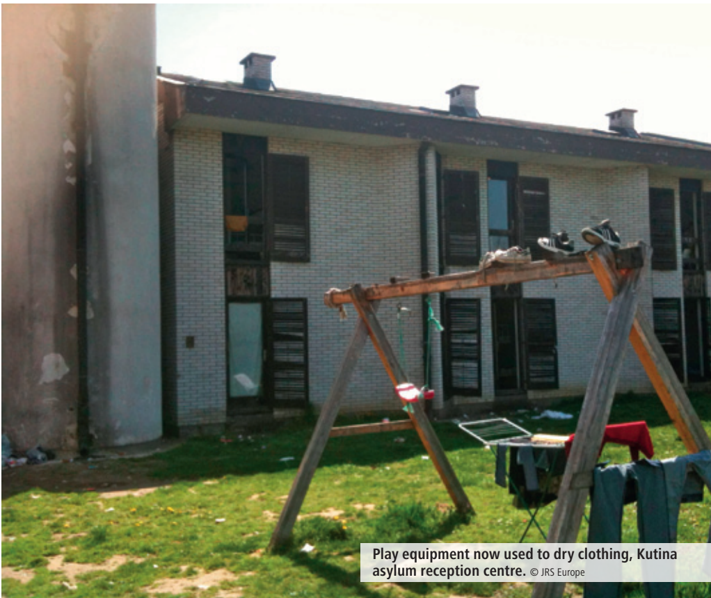
Play equipment now used to dry clothing, Kutina asylum reception centre.

Upon entering the reception centre at Porin, one is immediately struck by the run-down state of the building: pieces of concrete are falling off the walls and the stairs to the entrance are chipped and broken. The grass around the centre is overgrown and the entire exterior is in need of maintenance. Inside the building the walls are marked with