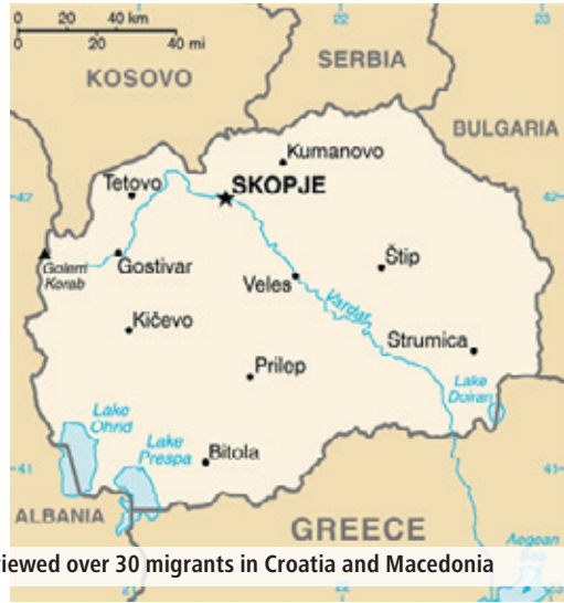
JRS interviewed over 30 migrants in Croatia and Macedonia

to crossing borders, transiting to their country of destination safely and resolving their legal status once there. These are the experiences that JRS report hopes to illuminate.