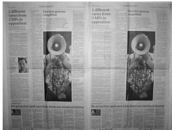
Photo: “Two Versions of the Strait Times”