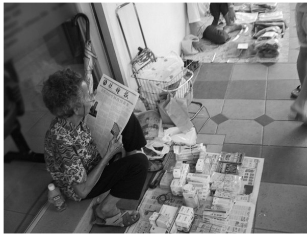
Photo: "Elderly lady reading the Hammer " (from The Workers' Party of Singapore's website)

There are several political party newspapers. Petir , the party organ of the PAP is the most regularly published. Several opposition parties also publish and distribute their own party newspapers— Hammer (Worker's Party), New Democrat (Singapore Democratic Party) and Solidarity (National Solidarity Party). Opposition party publications sometimes only appear intermittently because of party constraints. Opposition party newsletters are not available in news stands and bookshops because their owners usually refuse to carry them. Instead, opposition newsletters are sold through weekly direct sales in residential estates and are also available through subscription. 46