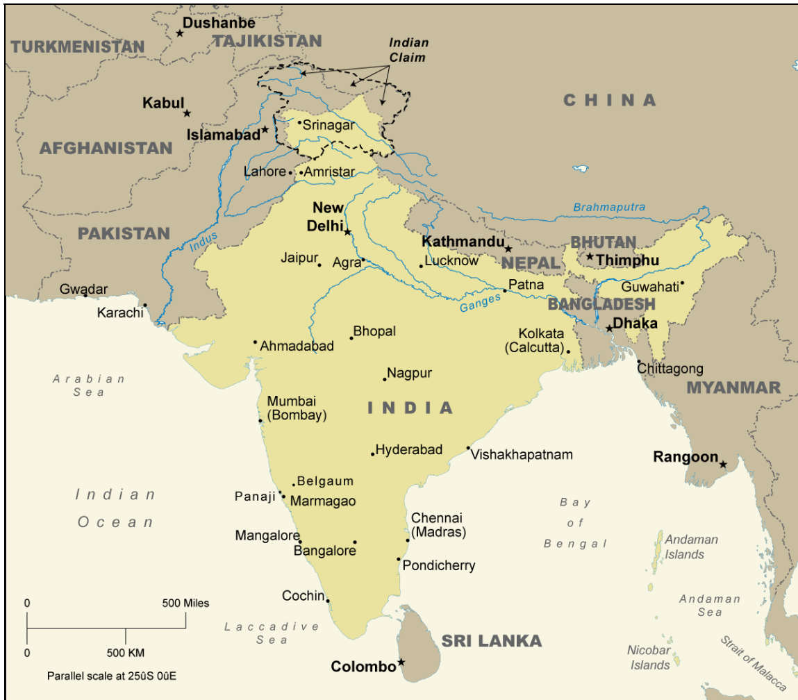
Figure 4. Map of India

Source: Map Resources. Adapted by CRS. (11/2010)