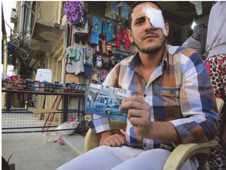
The shop owner injured in the bombing.

About 12:30 p.m. on October 24, 2013, a car bomb exploded on al-Ahram Street near the