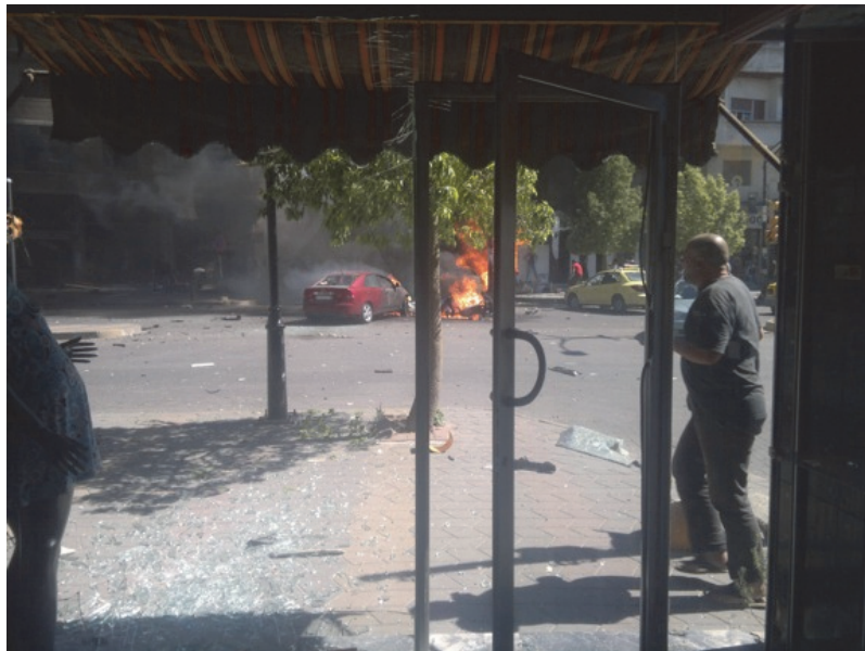
The aftermath of the second bombing.

He also said that a 19-year-old girl, who was celebrating her birthday at a restaurant next door, and was standing on the street when the bomb exploded, was killed. "There was blood everywhere," he said. 208