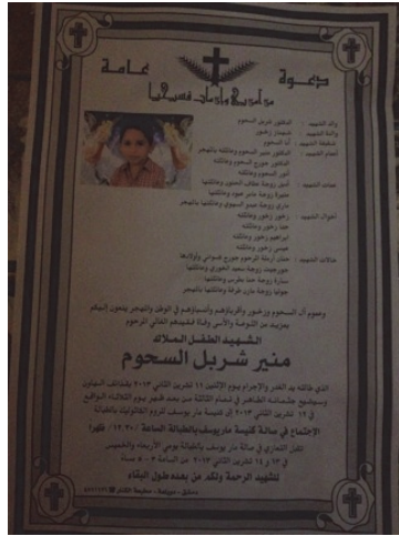
Munir al-Suhoom's death announcement.