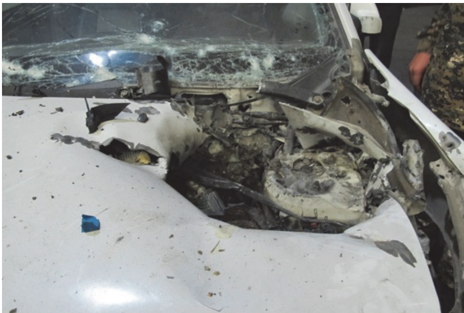
Site of mortar attack that struck a car and injured four men in Bab Touma on November 13, 2013.

The entrance to Bab Touma, a mixed commercial and residential area, had also been repeatedly shelled, according to local residents. A government Military Intelligence checkpoint is located at the entrance of the neighborhood to search vehicles, which may have been the target of some of these attacks.