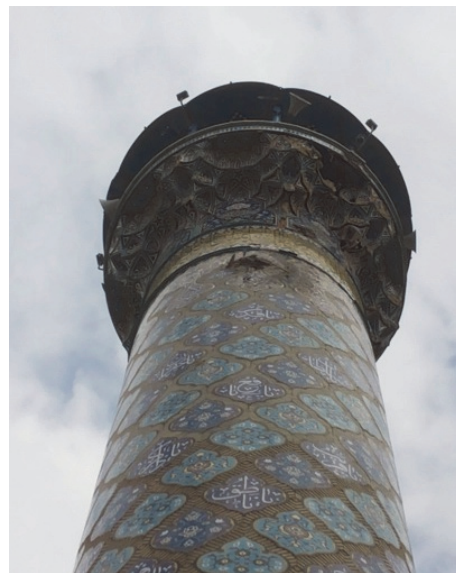
Sayida Zeinab minaret shelled from the west.

In two mortar attacks on the mosque on November 7, 2013, 45 people in the mosque courtyard were injured according to a doctor at the al-Mujtahid hospital who received the wounded. 172