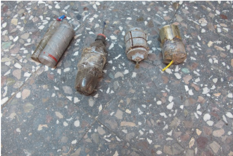
Improvised explosive devices seized by Military Intelligence in Homs.