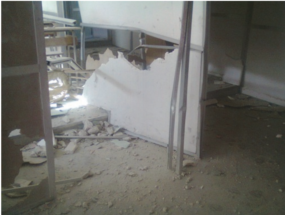
Damage caused by a mortar shell to the Akrama al Makhzoumi school.