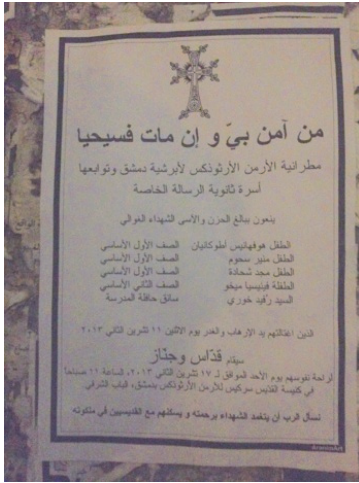
Death announcement. © 2013 Human Rights Watch