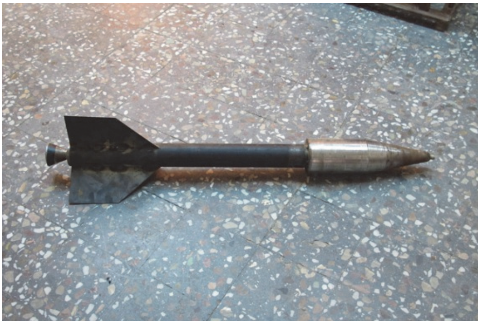
Locally produced rocket seized by Military Intelligence in Homs.