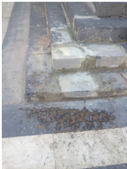
Hijaz train station, damage from November 6, 2013 explosion.