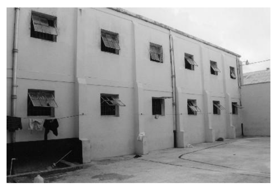
Exercise yard. Permission to use the yard may be cancelled in the case of bad Weather. Female prisoners told Amnesty International that they were denied the right to exercise at all.

It should be noted that the Prison Staff Association said that exercise could be provided on the other three days a week but that management had failed adequately to discuss the proposition with staff. They also claimed that the lack of medical cover meant that staff got inadequate medical treatment, exacerbating staff absenteeism. The latter assertion was ridiculed by the Ministry of Health and Ministry of Security officials, who said that staff abused sickness absenteeism and that many viewed the 28 days sickness absence permitted per annum as an entitlement.