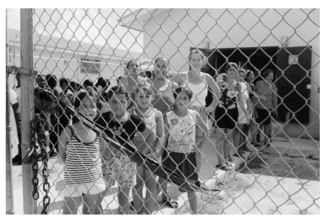
Children detained alongside female detainees line up for roll call. Contact with male relatives in adjoining huts is prohibited. The huts are separated by a barbed wire fence.