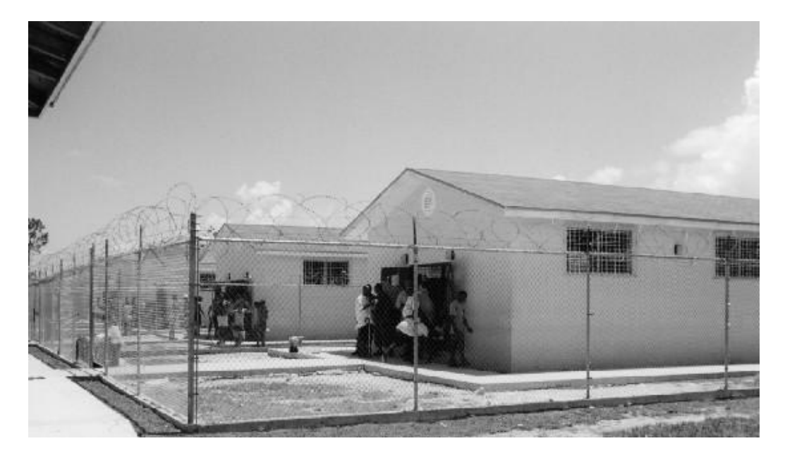
Photo of huts at Carmichael Detention Centre surrounded by internal barbed wire fence.