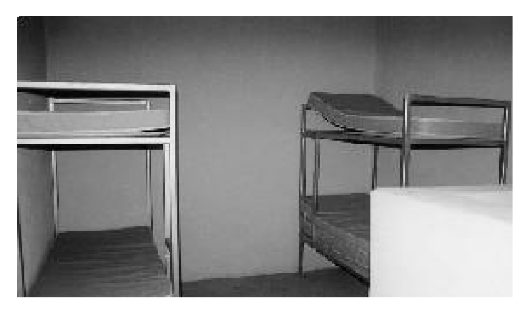
Cell in the newly constructed remand centre.

prisoners awaiting trial. Amnesty International also interviewed a number of lawyers who expressed concerns about gaining access to their clients.