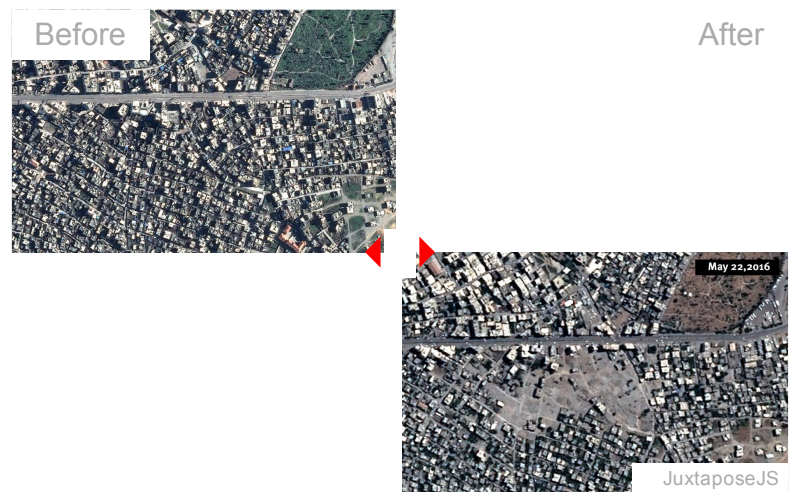
Satellite imagery recorded before and after building demolition in the neighborhoods of Cudi and Sur.

Human Rights Watch reviewed lists of the dead compiled by Cizre-based lawyers which show that as many as 66 Cizre residents, including 11 children, were killed by gunfire or mortar explosions during security operations between December 14 and February 11, 2016. According to witnesses and victims interviewed by Human Rights Watch, in some cases the security forces opened fire on civilians on the streets carrying white flags. The available information also indicates that security forces surrounded three buildings and deliberately and unjustifiably killed about 130 people – among whom were unarmed civilians and injured combatants – trapped in the basements.