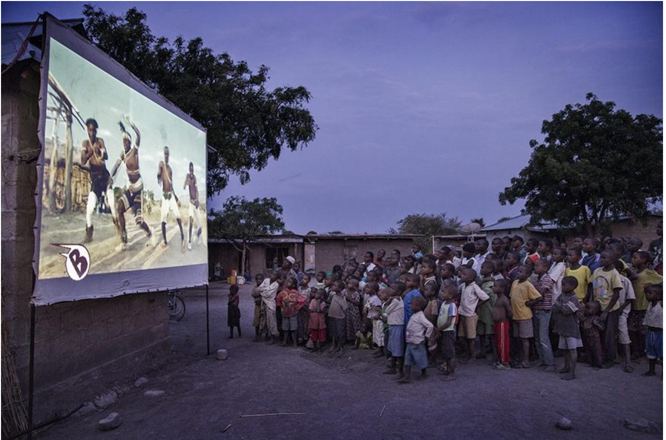
Children watch a video at an outreach event held by Agape AIDS Control Program, a nongovernmental organization working to end child marriage. Shinyanga, Tanzania. August 4, 2014.

For example, in Malawi, various government entities, officially coordinated by the Ministry of Gender, Children and Community Development, are mandated to tackle violence against women, including child marriages. The Ministry of Justice is responsible for the prosecutors, the Ministry of Gender, Children and Community Development for child protection workers, and the Ministry of Interior for the police. However, there is little communication or formal referrals on specific cases among these entities.