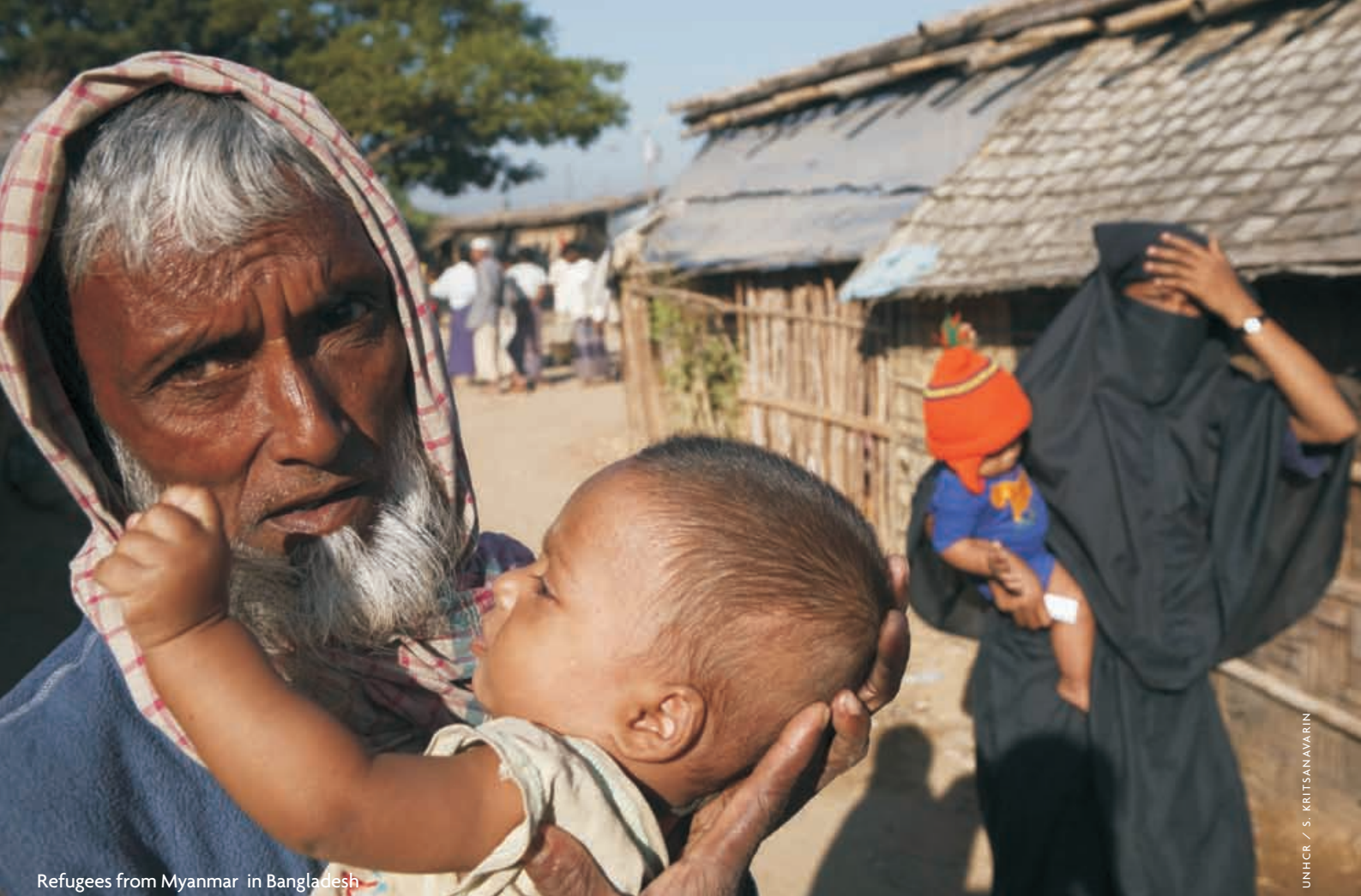
Refugees from Myanmar in Bangladesh