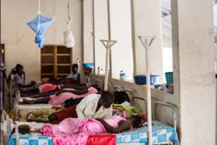
Above: The maternity ward in Bor Hospital. South Sudanese women face the highest maternal mortality rate in the world—estimated at 2,054 deaths per 100,000 live births. Bor, Jonglei State, February 2013.