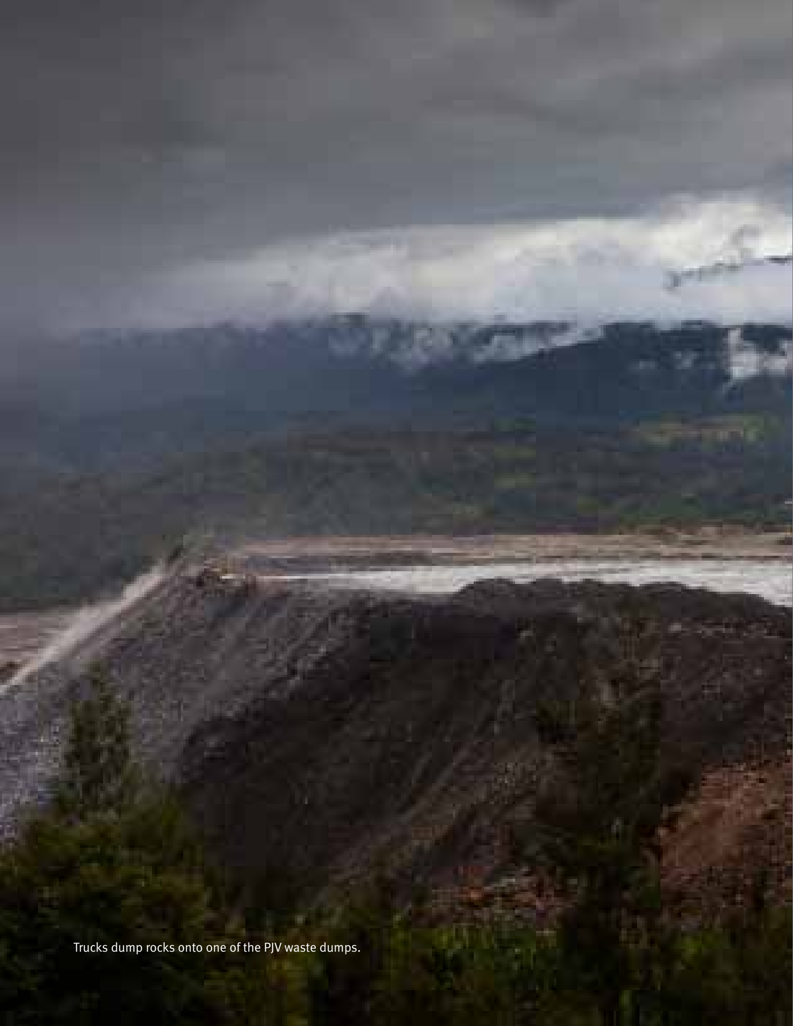
Trucks dump rocks onto one of the PJV waste dumps.