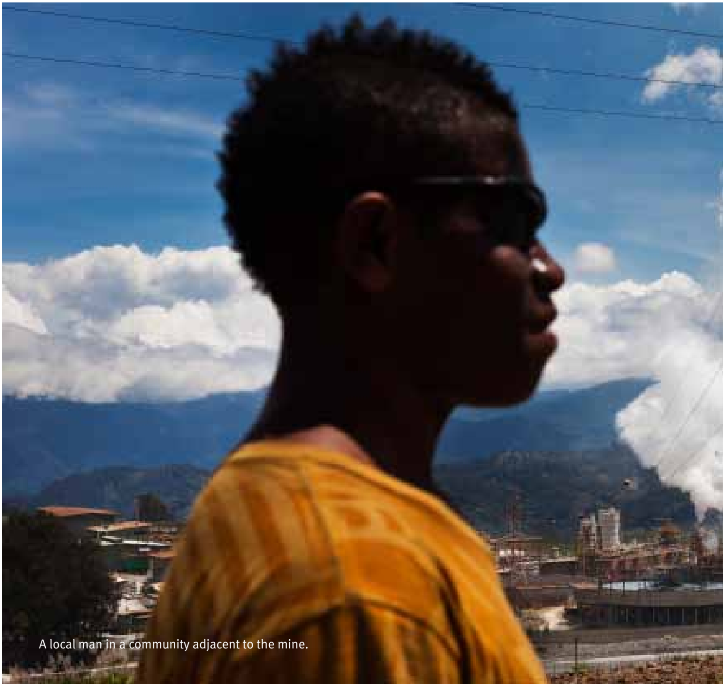
A local man in a community adjacent to the mine.

provided material support to a police investigation into the allegations of sexual violence by members of the PJV security force.