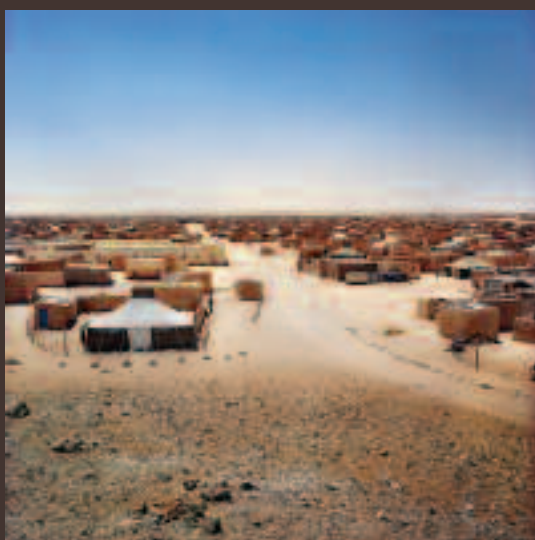
A Sahrawi refugee camp near Tindouf, Algeria, Tindouf.

In order to enhance human rights protections for the Sahrawi people, Human Rights Watch recommends that the U.N. Security Council enlarge the mandate of the MINURSO peacekeeping mission to include human rights monitoring both in Moroccan-controlled Western Sahara and the Tindouf refugee camps, or establish an alternative regular mechanism to monitor and report on conditions.