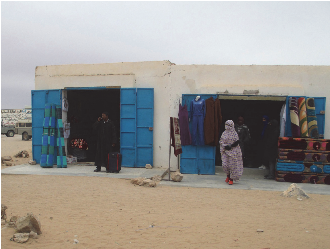
Shops in the market of Smara camp, where residents buy household goods as well as foods such as fruits, vegetables, and meat, which are not typically included in UN food aid.

important to refugees' ability to maintain basic nutrition and living standards. Trade and animal husbandry provide income, household goods, and meat, milk, vegetables, and fruits, which are not typically included in international food aid. 59 Livestock herders in the Tindouf area bring their animals to graze in the less arid lands in Polisario-controlled Western Sahara. Traders visit Tindouf and Mauritania to buy food and household goods. Fuel traders transport Algerian gasoline to Polisario-controlled Western Sahara and Mauritania for sale.