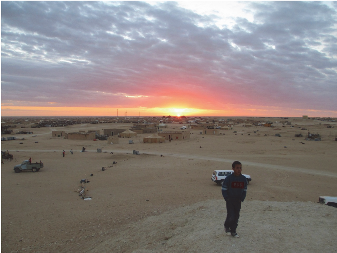
Sunset over Smara camp, the largest of five camps where Sahrawi refugees have lived since 1976.

King Hassan II of Morocco argued that Spanish colonization had interrupted Moroccan rule, which should resume once Spain left. Before Spain carried out the referendum, Morocco asked the UN General Assembly to refer the question to the International Court of Justice.