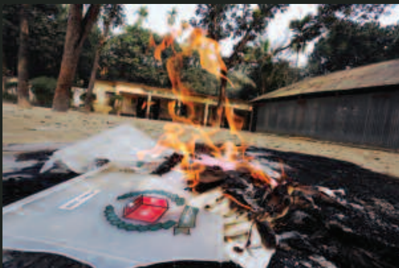
Election materials burn following an attack on a polling station in the northern town of Bogra, Bangladesh, on January 5, 2014.

Human Rights Watch calls on Bangladesh's main political parties to make unequivocal public demands on their supporters to desist from violence. The government in particular has the burden to ensure accountability for its security forces and to provide answers, justice, and compensation to victims regardless of their party affiliation.