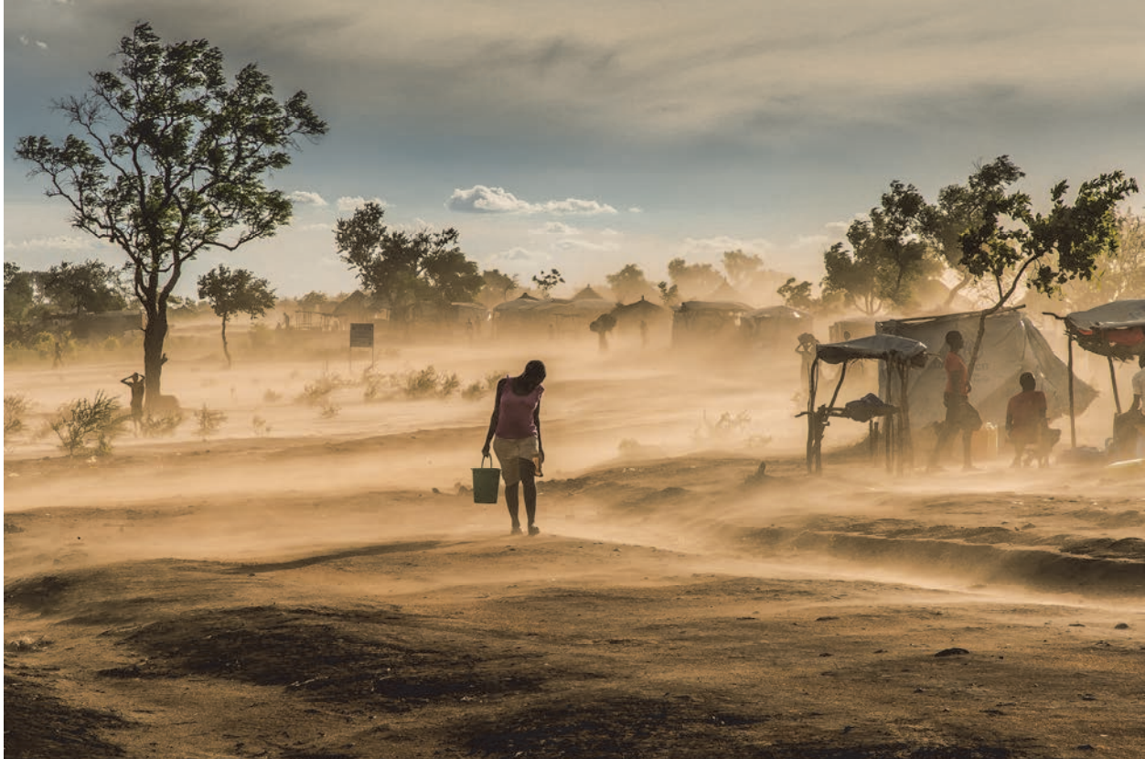
A young woman in zone 2 of the sprawling Bidibidi settlement in the West Nile region of Uganda, May 3, 2017.

to the conflict have failed to take all necessary and reasonable measures to stop the crimes or hold those responsible to account.