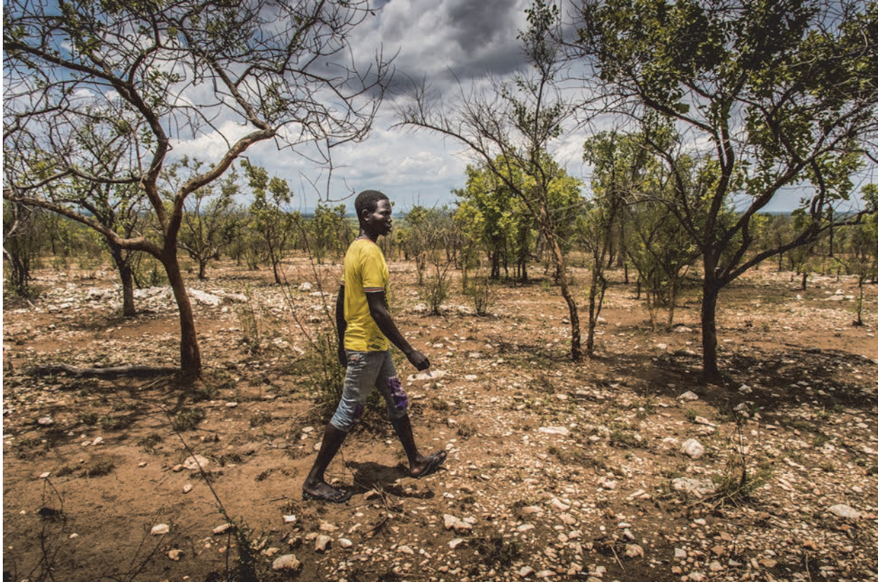
A refugee surveys the small plot of land allocated by Ugandan authorities to his family in the Bidibidi refugee settlement, April 8, 2017.

to Machar's IO in parts of Central and Western Equatoria --notably in and around Wondoruba, Mundri, Maridi and Yambio. 31