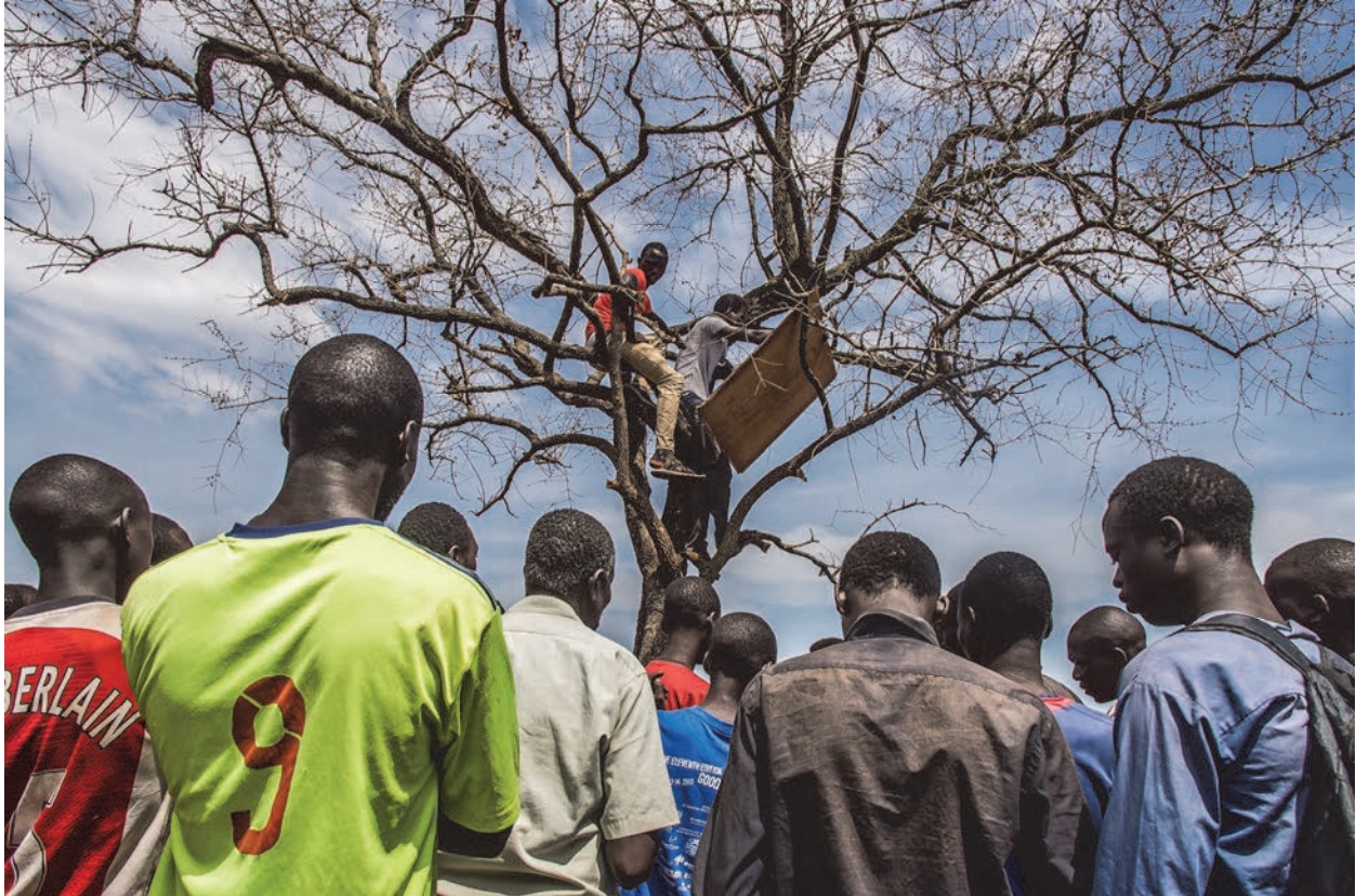
After registration at the Imvepi reception center, refugees wait for their names to be called for transport to their new home in the Bidibidi refugee settlement, in Uganda’s West Nile region, April 8, 2017.

between his forces and those of the government. As described below, his flight through the Equatorias also brought more skirmishes between government and opposition forces in the region.