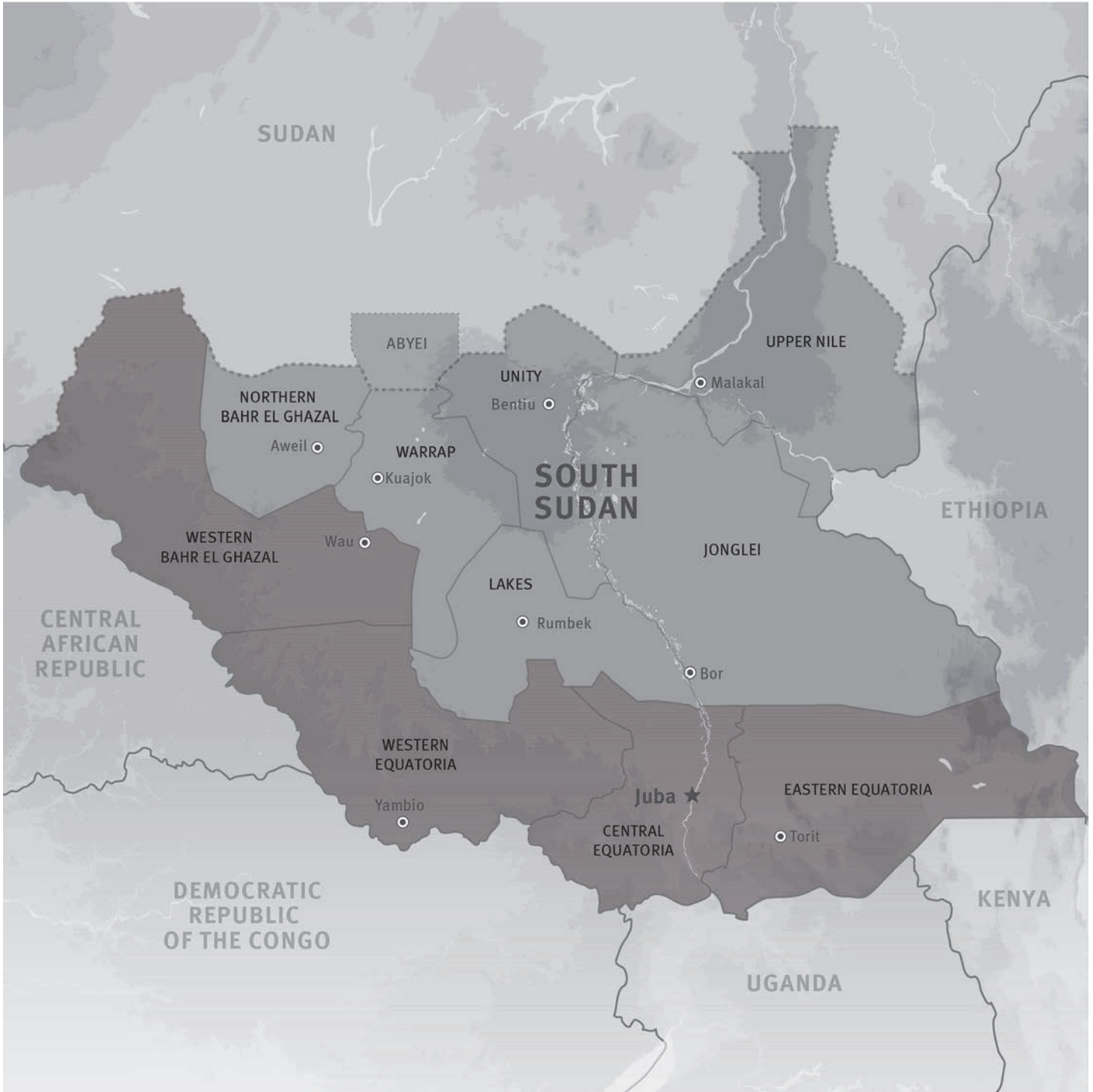
The regions of South Sudan formerly known as Western Bahr el-Ghazal, Western Equatoria, Central Equatoria and Eastern Equatoria states have been the most severely impacted by government counterinsurgency operations since late 2015.