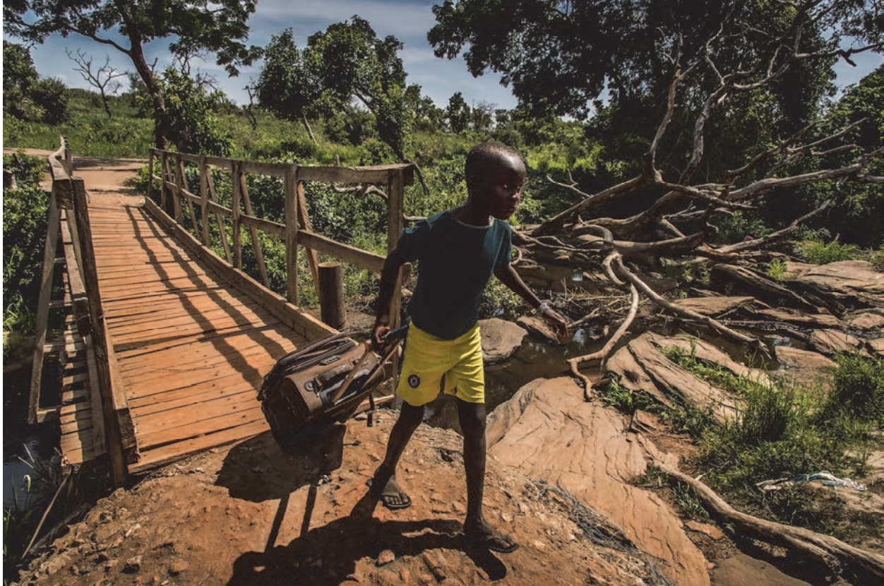
A boy at Busia, an unofficial border, crossing into Uganda. More than 700,000 South Sudanese refugees have crossed into Uganda in the past year, April 13, 2017.