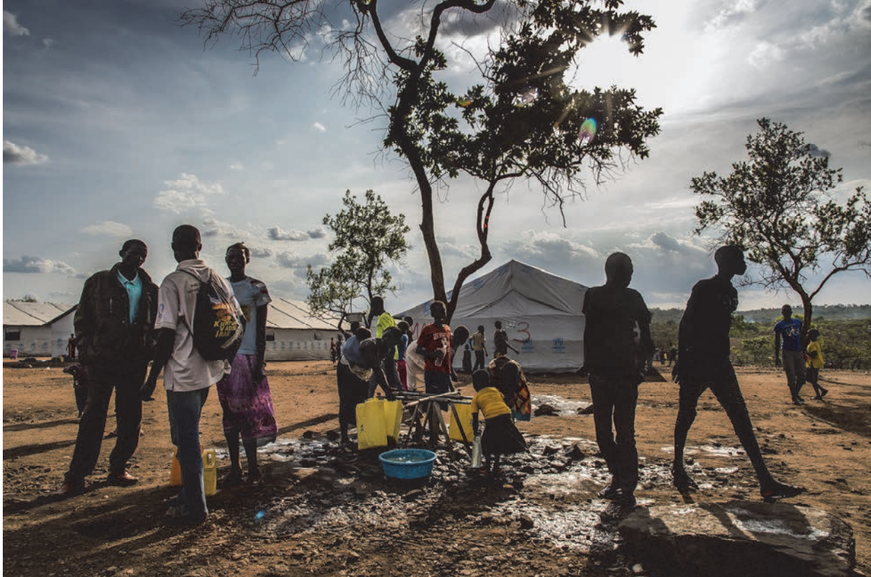
Refugees at a water point in the Imvepi reception center, in Uganda's West Nile region, April 8, 2017.