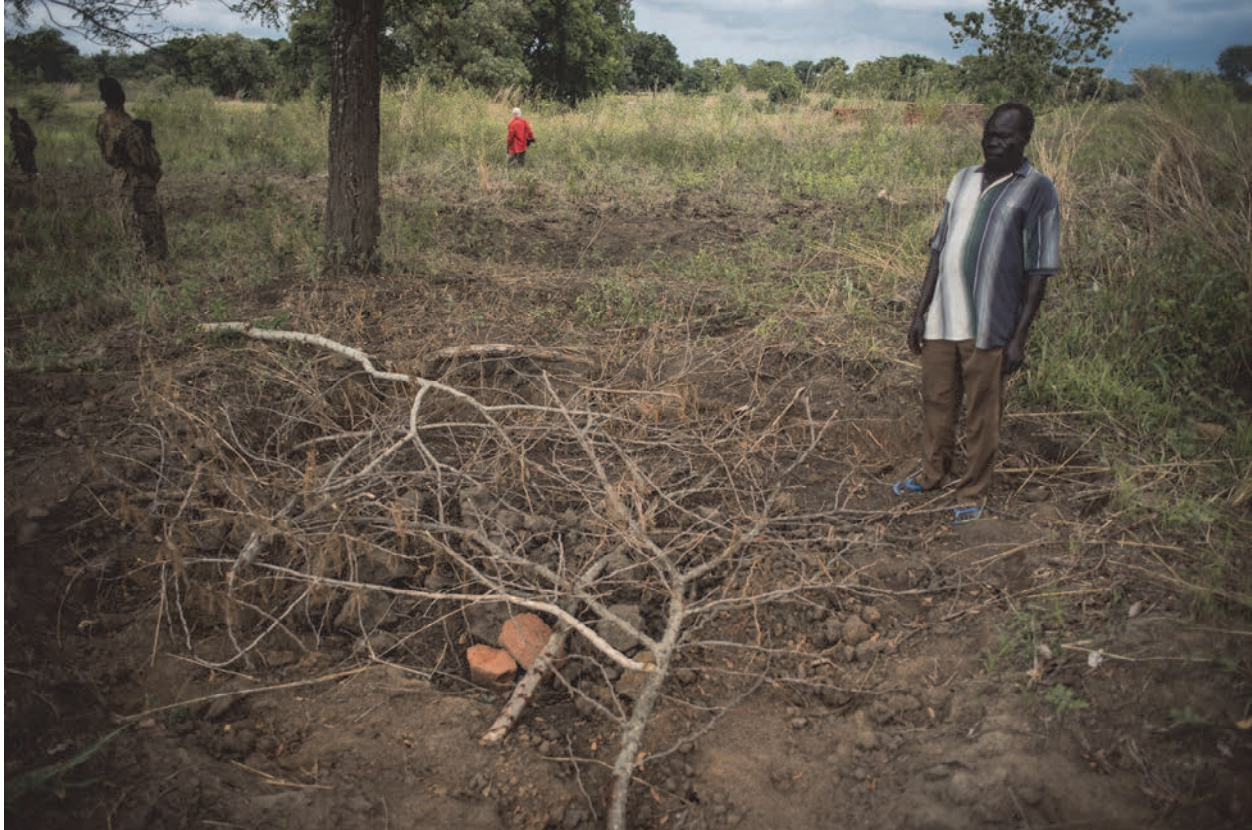
A mass grave outside Jalimo town in South Sudan's Kajo Keji county. The bodies of three civilians are buried there after they were killed during clashes between soldiers and rebels in Jalimo in early April, April 25, 2017.

One of the most violent government attacks was at Mondikolok, a town near Wudu. On January 22, 2017, as people gathered at the church for Sunday service, soldiers from the Mundari barracks arrived on foot and began to shoot through the crowded marketplace. They killed 6 people on the spot.