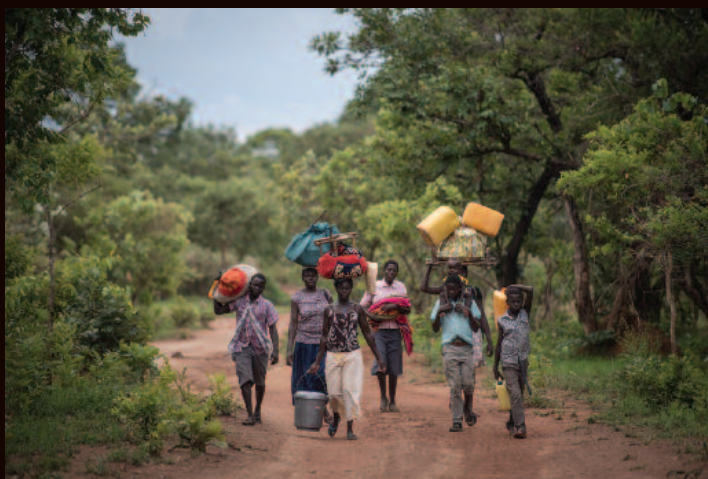
Civilians fleeing Kajo Keji county, toward the southern border with Uganda, April 27, 2017.

Human Rights Watch calls on the government of South Sudan to bring an end to the serious violations of humanitarian law, and to hold those responsible to account through credible investigations and prosecutions and by cooperating with the African Union to establish an agreed upon Hybrid Court for South Sudan. Human Rights Watch also calls on the United Nations Security Council to impose a comprehensive arms embargo and further targeted sanctions on those linked to violations of international human rights and humanitarian law – including President Salva Kiir and former vice president and head of the opposition, Riek Machar.