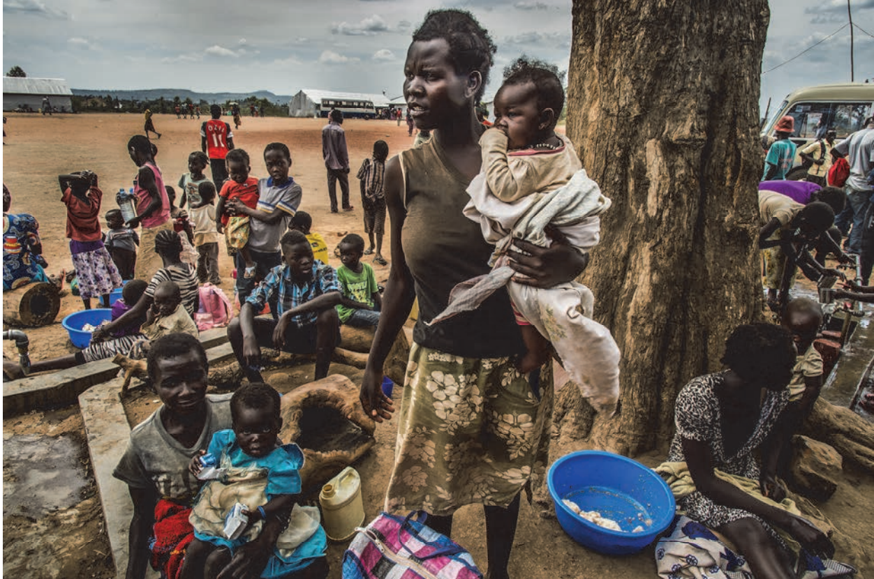
South Sudanese gather at the Goboro transit camp on the South Sudan-Uganda border, before moving on to refugee settlements further inside Uganda, April 11, 2017.

Although the parties to the conflict agreed in principle to the HCSS under the ARCSS, a key challenge for the HCSS was that South Sudan's government had yet to substantively engage with the AU Commission on the establishment of the court.