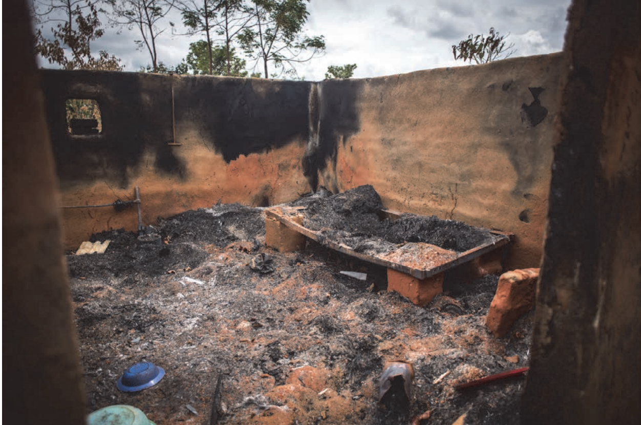
The charred remains of a home in the town of Loopo, in South Sudan’s Kajo Keji county. Opposition fighters who control the town claim government forces burned several homes following armed clashes in early April, April 25, 2017.