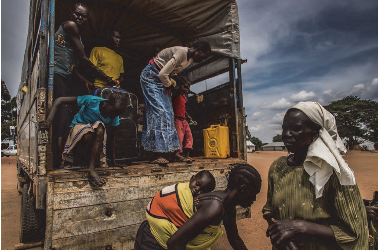
South Sudanese refugees gather at the Goboro transit camp on the South Sudan-Uganda border, on their way to refugee settlements in Uganda, April 11, 2017.

The impact of the violence and persistent abuses against the civilian population is devastating. Acute food insecurity is widespread. Six million South Sudanese, almost half the country's population, face severe food shortages. The outflow of refugees continues at an alarming rate, uprooting entire communities and effectively emptying swathes of land, and 1.9 million civilians remain internally displaced, with some sheltering on UN bases. The crisis is costing the international community billions of dollars.