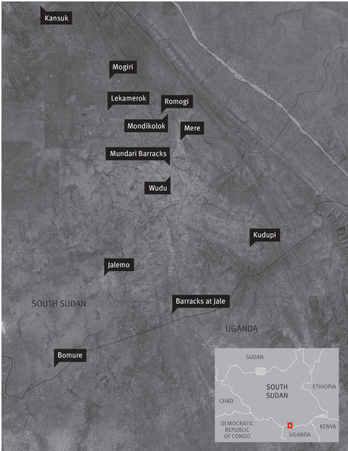
Key locations in Kajo Keji county where government forces' attacks since June 2016 have involved serious violations of international human rights and humanitarian law.