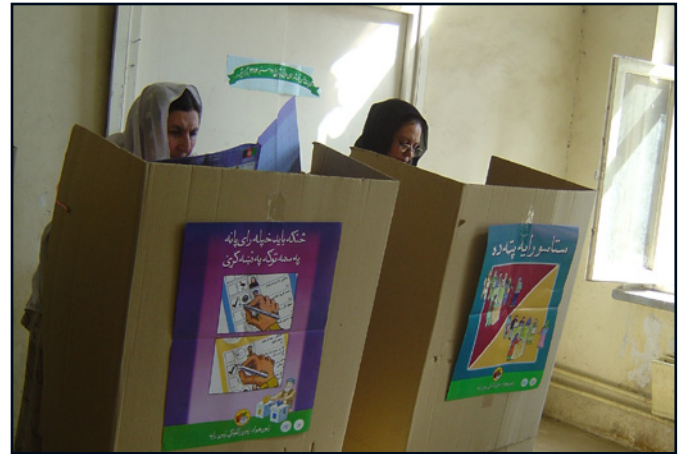
Women vote in 2009’s presidential election

Dear sister, when you talk about democracy you mean freedom—but what kind of freedom do we have? I will tell you a story. My sister studied until 12th grade but my father then engaged her to a person who was very poorly educated. My sister insisted that she did not want to marry this person and asked her father if she could continue studying. She was not allowed to do this however and she was married to this person in [an insecure] district. It is years since we have seen her—my father and brothers