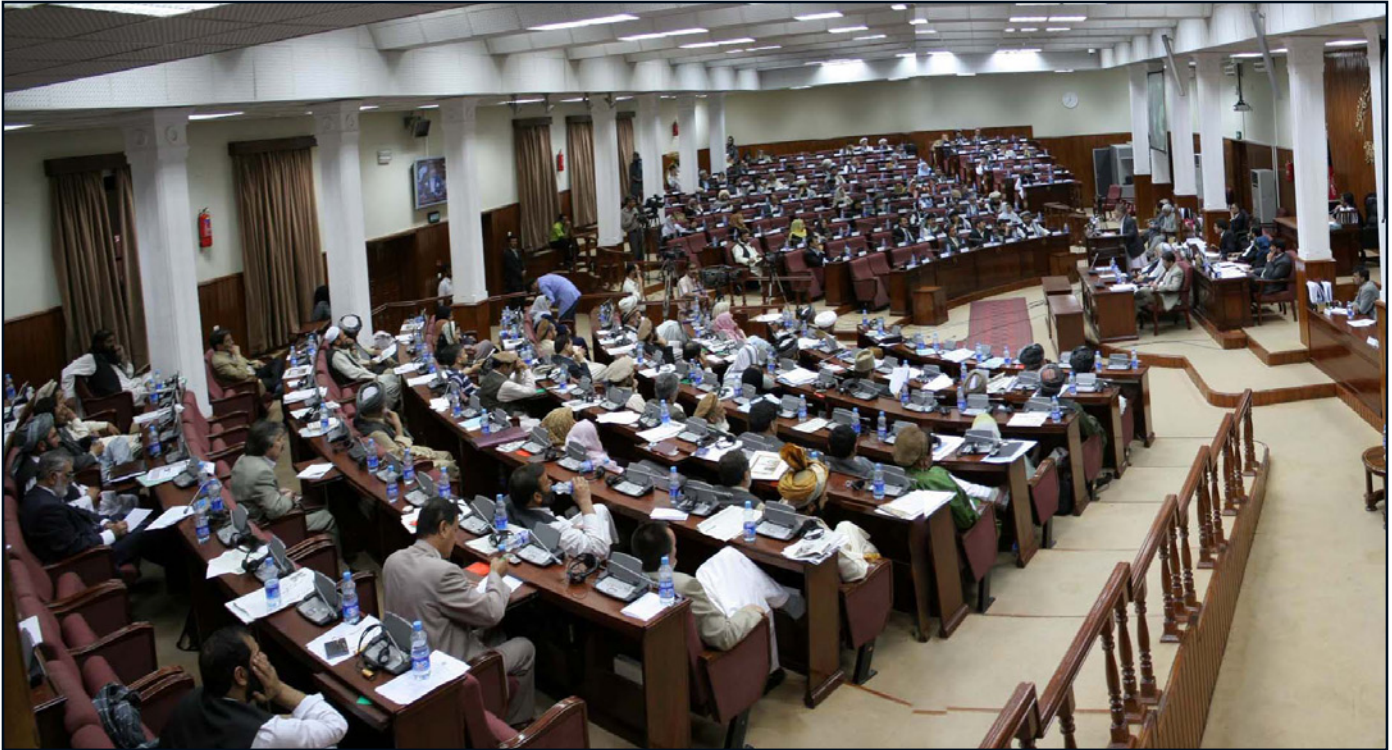
The Wolesi Jirga in session

been no growth of democracy, but instead the actions of the government and the MPs have defamed democracy. Now the people hate this type of democracy that has been demonstrated by the present government. Sixty-two million dollars were given for the electricity and power cables for our province but we don't know where this money has been spent...These government officials only try to cheat the people because their reports are completely opposite with what we see in practice.