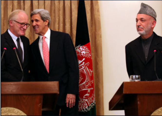
Former UN Special Representative Kai Eide, US Senator John Kerry and President Hamid Karzai during a press conference concerning 2009's Presidential election

The idea of democracy being used as a way to impose foreign interference is clear here, indicated particularly by the second statement regarding the mujahiddin's militant stance against the PDPA in the 1980s. Afghanistan has experienced a number of attempts at externally-imposed rule, and thus it is not really surprising that for many, the post-2001 attempt to democratise is seen as another of these impositions. This statement represents a provincial viewpoint, however, which is not necessarily shared by other respondents in Kabul who still blame the mujahiddin for destroying the city in the 1990s. Nevertheless, also clear from the statements above is the sense of resentment felt toward this interference in Afghan affairs on the part of a foreign power. But while this interference or imposition in itself is evidently unwelcome, it is necessary to explore further the differing reasons why this is the case, and what kinds of intervention provoke the most negative reactions. Afghan voices raised against "the West" and its presence in Afghanistan appear to have become louder and more prevalent over time, which could reflect the gathering pace of disillusionment with the internationally-assisted Karzai government and the way Taliban propaganda, informed by the rhetoric of Al Qaida, has resonated with an increasing number of people as a result. In the last quotation, however, the respondent states that "democracy"