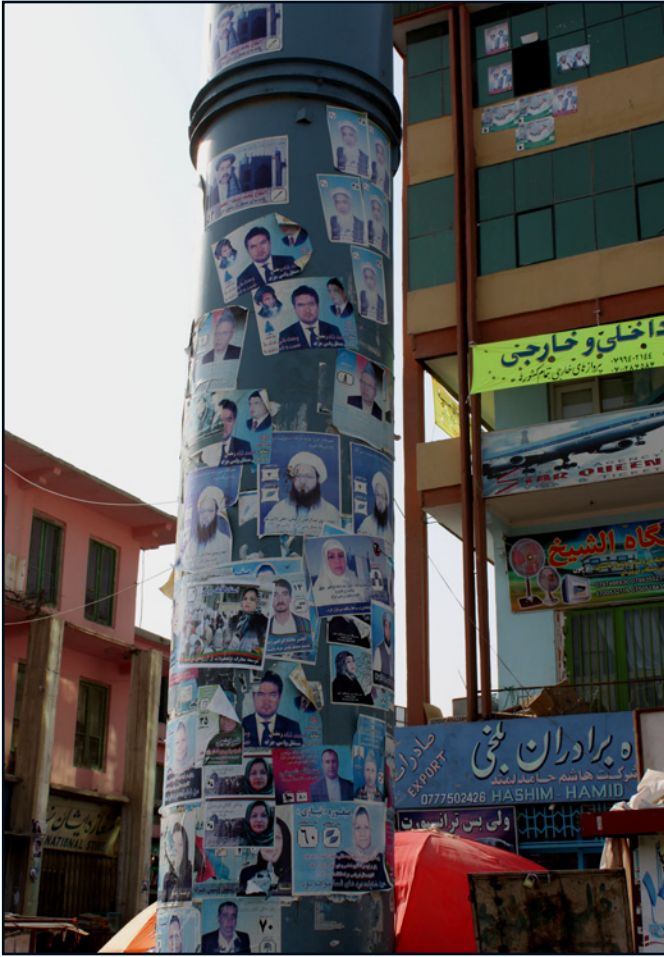
Campaign posters crowd street furniture in Mazar-i-Sharif, 2010

However, in statements about political parties, the problems raised appear to refer to broader concerns about the very principle of political competition, and many respondents appeared genuinely concerned about the idea of competition between parties or groups in general. This is due in part to the legacy of conflict in Afghanistan, and the way threatened or actual violence has been used as a tool of political negotiation. This is also reflected in perspectives on regular stand-offs in parliament between the government and different groups who would now classify themselves as in opposition. When respondents in a related AREU project on parliamentary elections talked about the rise of the so-called “opposition,” an overwhelming number stressed the need for reconciliation between the two groups in order to produce an effective, unified