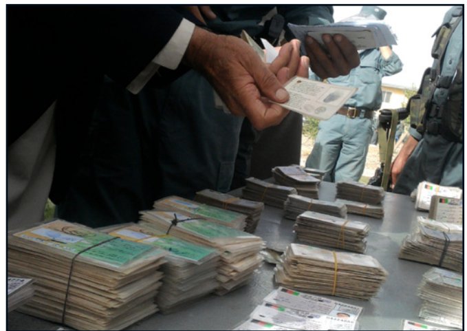
Officials examine evidence of fraud after 2010's parliamentary election

In the PC election last year there were some existing PC members and also some new candidates, but about 70 percent of the