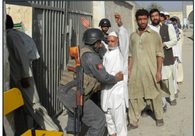
Police guard a polling centre in Kandahar during 2009’s presidential election

term perspective, it is possible to see the effects of instability in recent elections, or in bargaining for MPs’ votes in plenary debates, for example. No actor is certain of their support bases and cannot trust the promises of candidates, voters or MPs because there is no incentive to play by the rules when nobody else is doing so. Seen in the longer-term, however, this definition of instability applies equally to the frequency of regime change in Afghanistan over the last century. As administrations have come and gone, they have introduced ostensibly different rules with varying degrees of enforcement. These have usually been applied in different ways to different people depending on the alignment of patronage networks and deal-making occurring at any given time.