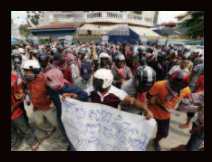
Protesters outside the Phnom Penh home of Kem Sokha, vice president of the opposition Cambodia National Rescue Party, demanding his resignation as National Assembly deputy house president. October 26, 2015.

Human Rights Watch calls for a further, full and independent investigation of the October 26 attack, for such a legal inquiry to be supported by the United Nations, and for the fair prosecution before Cambodian courts of all those responsible regardless of position or rank.