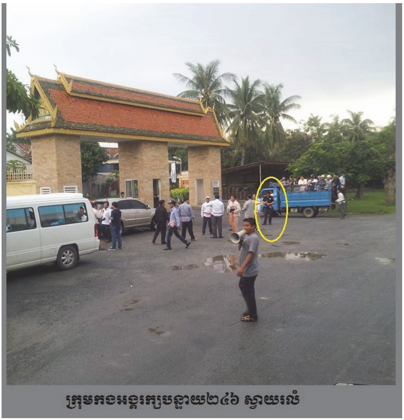
A person believed to be Sot Vanny (circled) at the Svay Rolum ("246") BHQ Base.