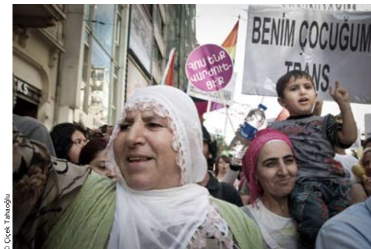
1. Kurdish women marching for the Trans Pride. Banner says «my child is transsexual» in Turkish. Purple banner says «we are here, get used to it» in Armenian. Istanbul, 2011. 2. Hrant Dink Memorial Day, January 19, 2011.