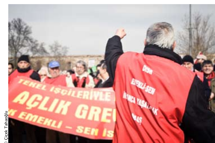
Tekel workers strike

Finally, if it is to be welcomed that during the last decade the physical safety of human rights defenders has continued to improve, it is feared that the current criminalisation of human rights defenders under anti-terrorism legislation risks to expose them again to physical abuse by non State actors.