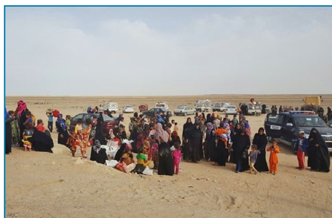
Above: Newly displaced families arriving in Kilo 18 camp.

Second, civilians have not been able to access genuinely safe routes away from conflict and violence. Those who do manage to escape often encounter further threats to their lives on their way to relative safety as routes are contaminated with unexploded ordnance and are sometimes patrolled by ISIS or other armed groups. Even once civilians do manage to escape these dangers, they face subsequent impediments to