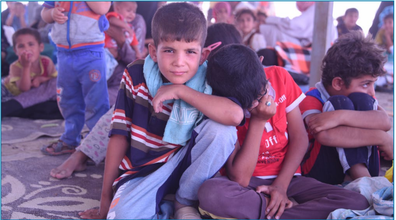
Above: Children, women and the elderly make up most of the population in the displacement camps in Ameriyat al Fallujah.