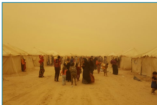
Above: Newly displaced families from Fallujah arrive in camps in Ameriyat al Fallujah.

In the wake of Fallujah, the humanitarian community has faced challenges in meeting the needs of the large influx of IDPs, due in part to bureaucratic barriers and a lack of sufficient preparedness. In order to gain access to Anbar aid agencies must complete a number of procedures, beginning with registration in Baghdad, followed by securing a letter from the Baghdad National Operations Centre in order to operate in Anbar. They must then obtain a facilitation letter for each individual needing to cross the Zbebiz Bridge into Anbar governorate. While the need for a system of registration is clear, the current procedures are time consuming and impact on the ability to respond quickly.