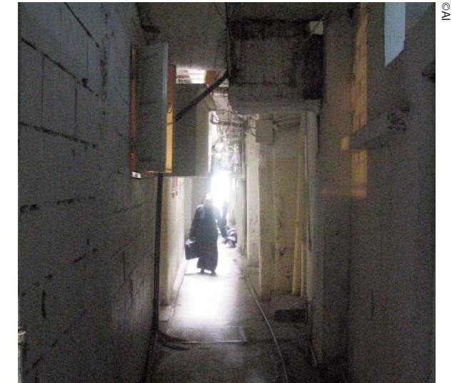
Building extensions block the sunlight in the alleyways of Ein el-Hilweh camp, March 2005

Lebanese law specifies that only Lebanese children have a right to free primary education. This violates international law that Lebanon has promised to respect, law that obliges states to provide free and compulsory primary education without discrimination on the basis of children’s status as refugees or asylum-seekers, any other legal status, or the status of their parents or guardians.