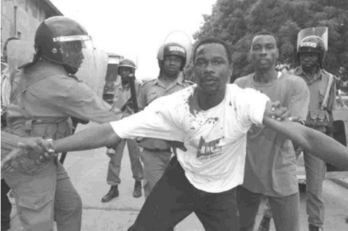
Tanzanian Police beating a civilian (one of many) at Darajani in Stone Town, Zanzibar, 27th January 2001, during the nation-wide CUF peaceful demonstrations