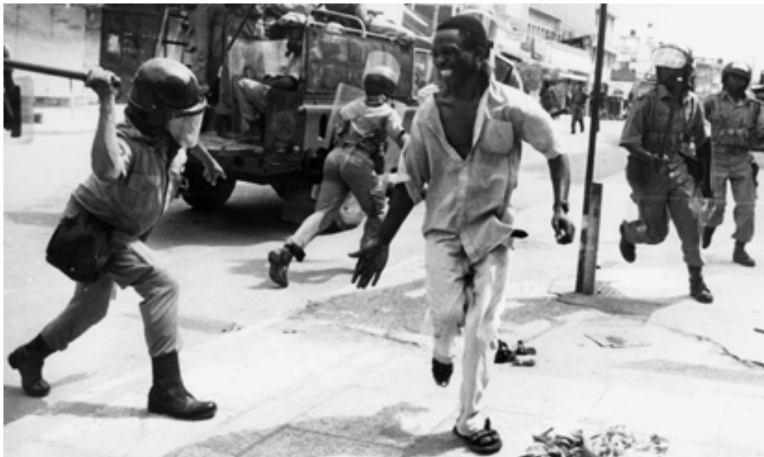
Tanzanian Police attacking a civilian (one of many) in Stone Town, Zanzibar, on 27th January 2001.