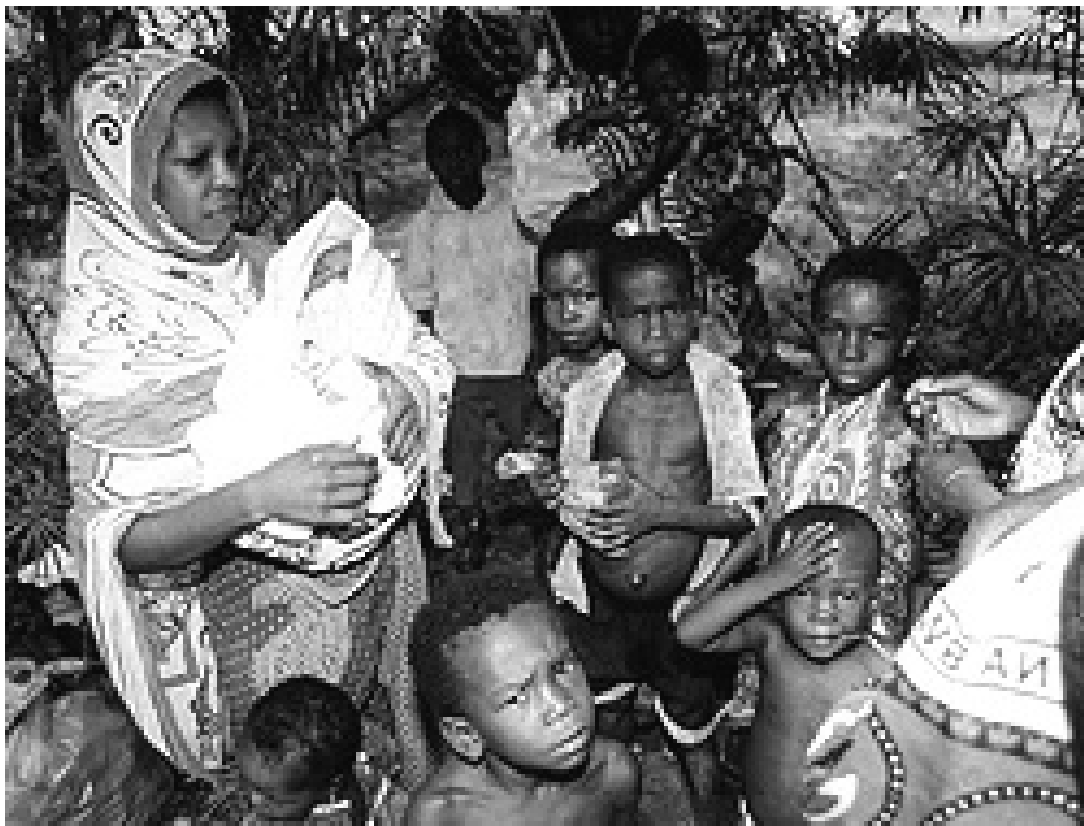
A group of refugees, including babies, children and women ponder their fate upon arrival at Shimoni in the Kenyan South Coast after fleeing the violence in Zanzibar and Pemba. Some 169 refugees including four Members of Parliament of the Civic United Front (CUF) fled to Kenya between 27 January 2001 on Jan 31, 2001.

88. Several people who took part in these demonstrations recounted that the tear gas used was already expired and so had no effect.