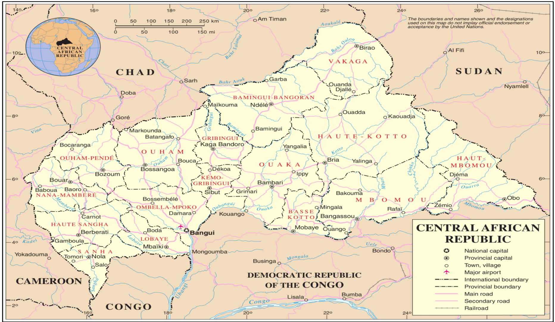
Annex: Map of Central African Republic