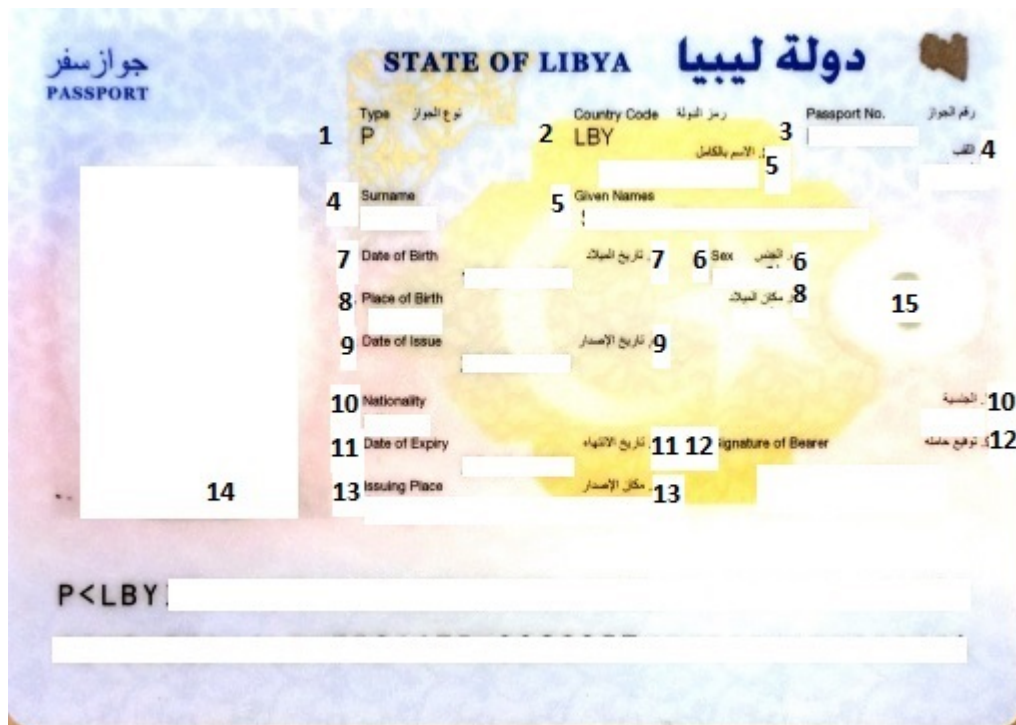
From a Libyan source

This is an image of a new Libyan passport. The serial number of the passport is printed in the title page as well as on the passport data page which contains the following details: 202