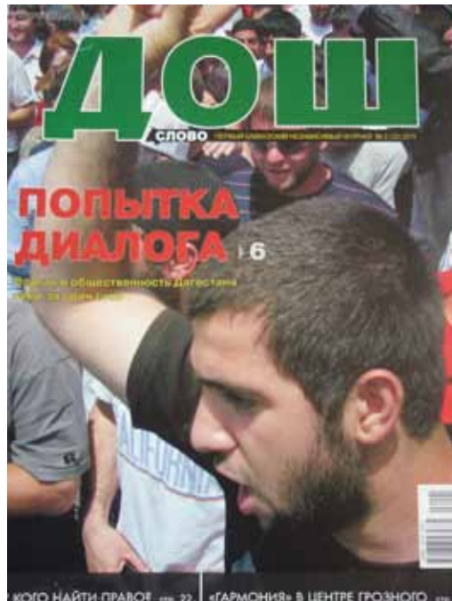
DOSH FRONT PAGE - DR

Karimov said he wanted “proper analysis” from journalists. “Not gratuitous criticism but the use of a true critical eye.