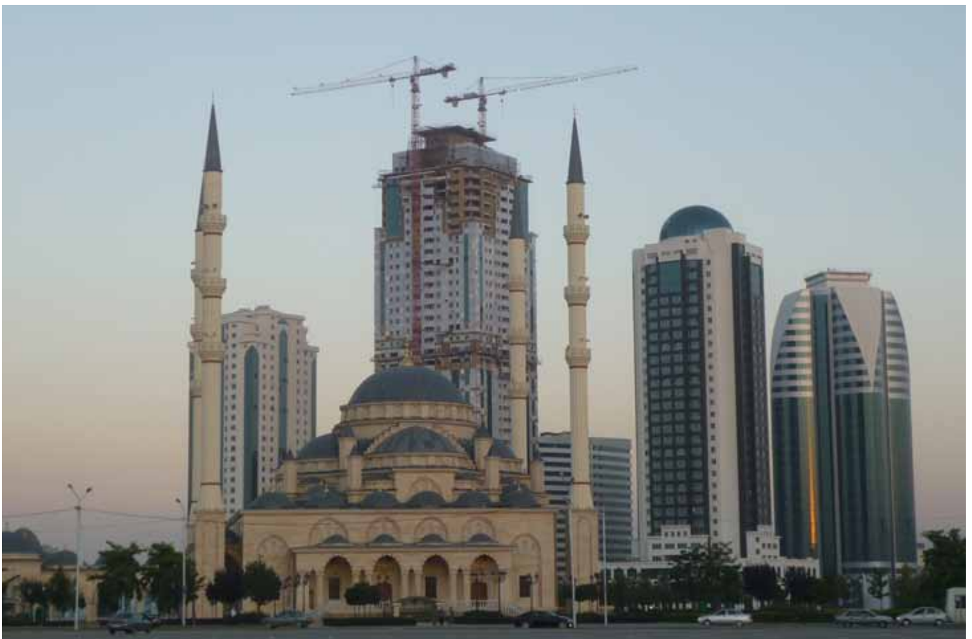
THE “NEW GROZNY” – THE CENTRAL MOSQUE AND A BUILDING UNDER CONSTRUCTION IN “GROZNY CITY.”

The path taken by Chechnya is portrayed everywhere in a resolutely optimistic light. There is universal unanimity about the system established by President Kadyrov with the help of Moscow’s petrodollars – restoration of relative order and rapid reconstruction of the republic’s infrastructure in exchange for complete domination by the ruling faction. Nowhere in the Chechnya-based media could Reporters Without Borders find any trace of the concerns of human rights organizations about the corollaries of this consensus: the total absence of political competition, arbitrary behaviour by the security forces, large-scale corruption, submission to puritan Islam and a personality cult.