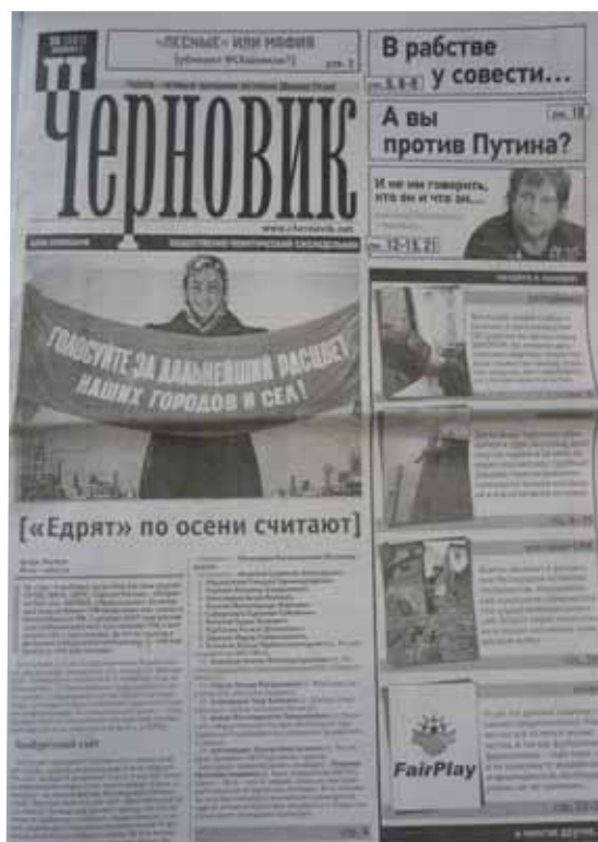
CHERNOVIK FRONT PAGE