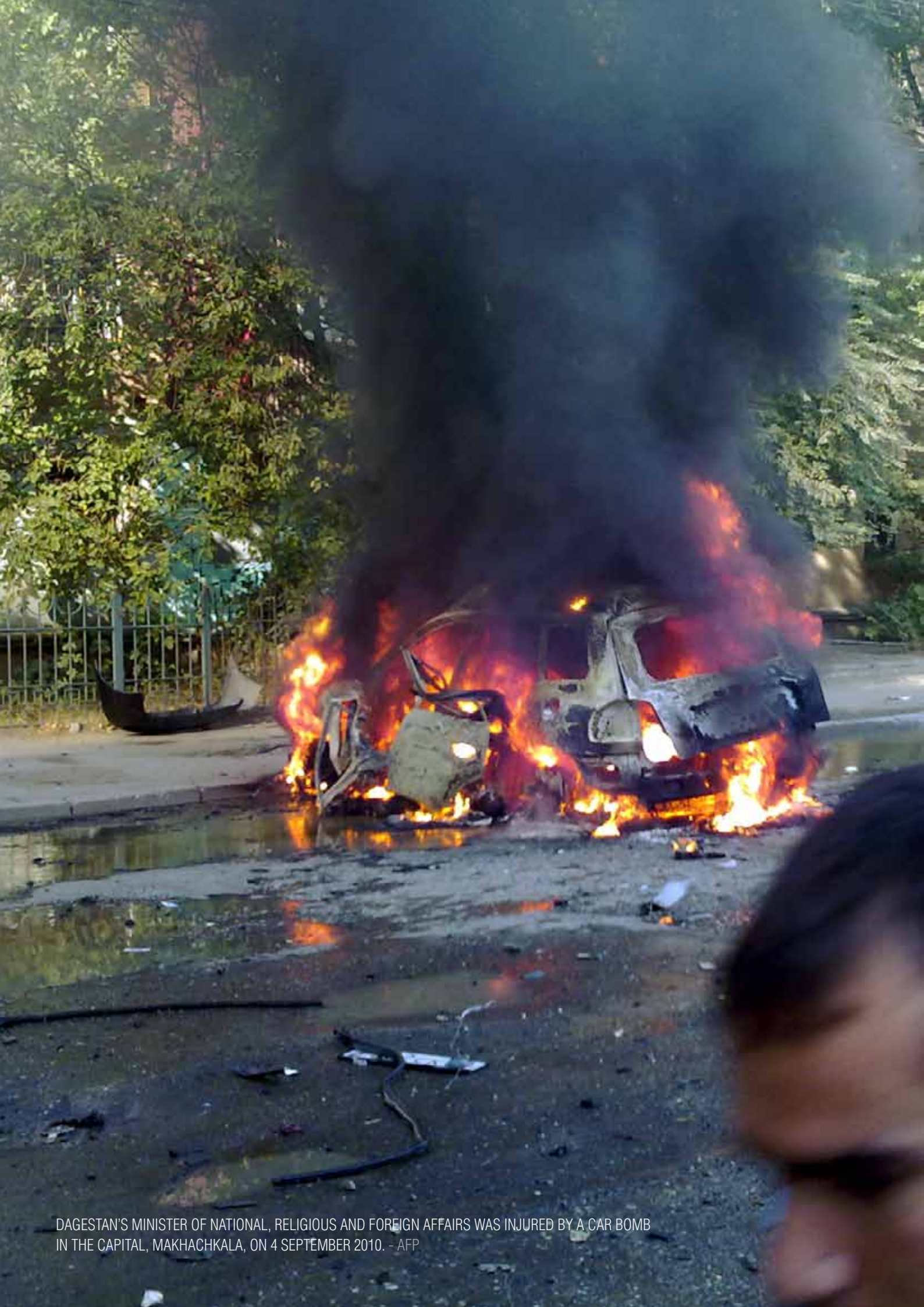
DAGESTAN'S MINISTER OF NATIONAL, RELIGIOUS AND FOREIGN AFFAIRS WAS INJURED BY A CAR BOMB IN THE CAPITAL, MAKHACHKALA, ON 4 SEPTEMBER 2010.