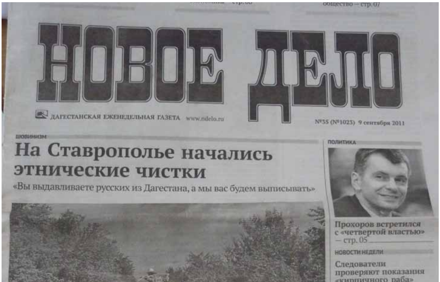
NOVOYE DELO FRONT PAGE