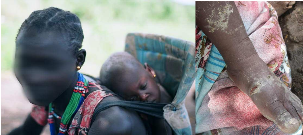
W.N, a girl around 18-months-old was beaten on the foot with a stick by the SPLA when they went to Thangajon on 12 July. Her mother B.K aged 30 and siblings including her sister A.N aged 12 were also beaten. The reported injuries were confirmed by medical evidence.

A.L.B, a 50 year-old woman told Amnesty International that “I was beaten when the SPLA soldiers came for disarmament on the evening of 2 August. I was in my house but the soldier took me outside my house where we cultivate. They gathered us in one place... I was with five other women. There were very many soldiers. When we were gathered they asked us ‘where are your sons?’ then they immediately started beating us with sticks, poles and rifle butts. They beat us many times, I couldn’t count. They used a gun to hit a boy on the back. They beat me on my back and chest. Eight soldiers beat me at first; then three more joined them. They beat me with sticks and poles from houses. I lost consciousness because of the beatings. I still feel pain in my chest now. I was beaten on two occasions in July. In total I was beaten three times.”