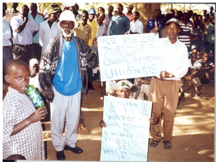
Figure 1: Workers Demonstrating Against Corrupt Labour Officials and Trade Union Representatives

Although the Kenyan Textile Union has taken action on behalf of EPZ workers, both in court, and in the case of the Athi River EPZ by negotiating a collective bargaining agreement (now expired), during the interviews, EPZ workers (most of whom were unionised) expressed criticism of the Union. EPZ workers feel under-represented within the Union, are distrustful of the role of trade union officials in negotiations with management, and generally feel that the unions are unable to deal properly with new labour situations resulting from the global context.