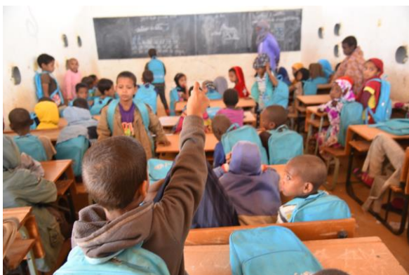
A student trying to catch the attention of his teacher in one of the six schools in Mbera camp

A total of 58,991 people are assisted by UNHCR in Mauritania.