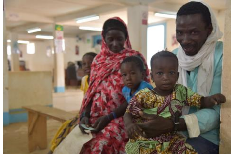
A Malian refugee family at UNHCR registration centre in Mbera camp waiting for the birth certificates of their children.

SGBV and child protection referral mechanisms are limited in Mauritania, preventing a comprehensive protection response. UNHCR is looking for partners to reinforce referral and protection pathways and advocate for the inclusion of refugees in all national protection mechanisms.