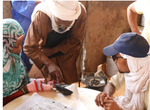
Magnetic cards being use during the cash and food distribution in Mbera camp

Furthermore, UNHCR and WFP ended the distribution of 13,810 magnetic cards in Mbera camp . During the monthly cash and food distribution, thanks to the magnetic cards refugees can withdraw their amount of money at the five distribution centres in Mbera camp and purchase their food at the camp market and other local shops.