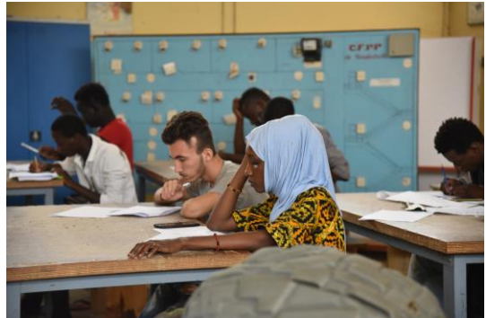
Urban refugees sitting the final exam on ILO training on renewable energies and construction

UNHCR and its partner SOS Désert finished the construction of two vaccination parks and the rehabilitation of two pastoral wells benefiting neighbouring villages of Mbera camp in the Hodh Echargui region, fostering peaceful coexistence among refugees and host community.