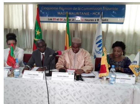
The Tripartite Commission Mali-Mauritania-UNHCR meeting in Bamako

695 Persons with Specific Needs - PwSN (284 male and 411 female) were assisted and accompanied to obtain magnetic cards at the registration center. In Nouadhibou, UNHCR provided 17 PwSN with cash assistance.