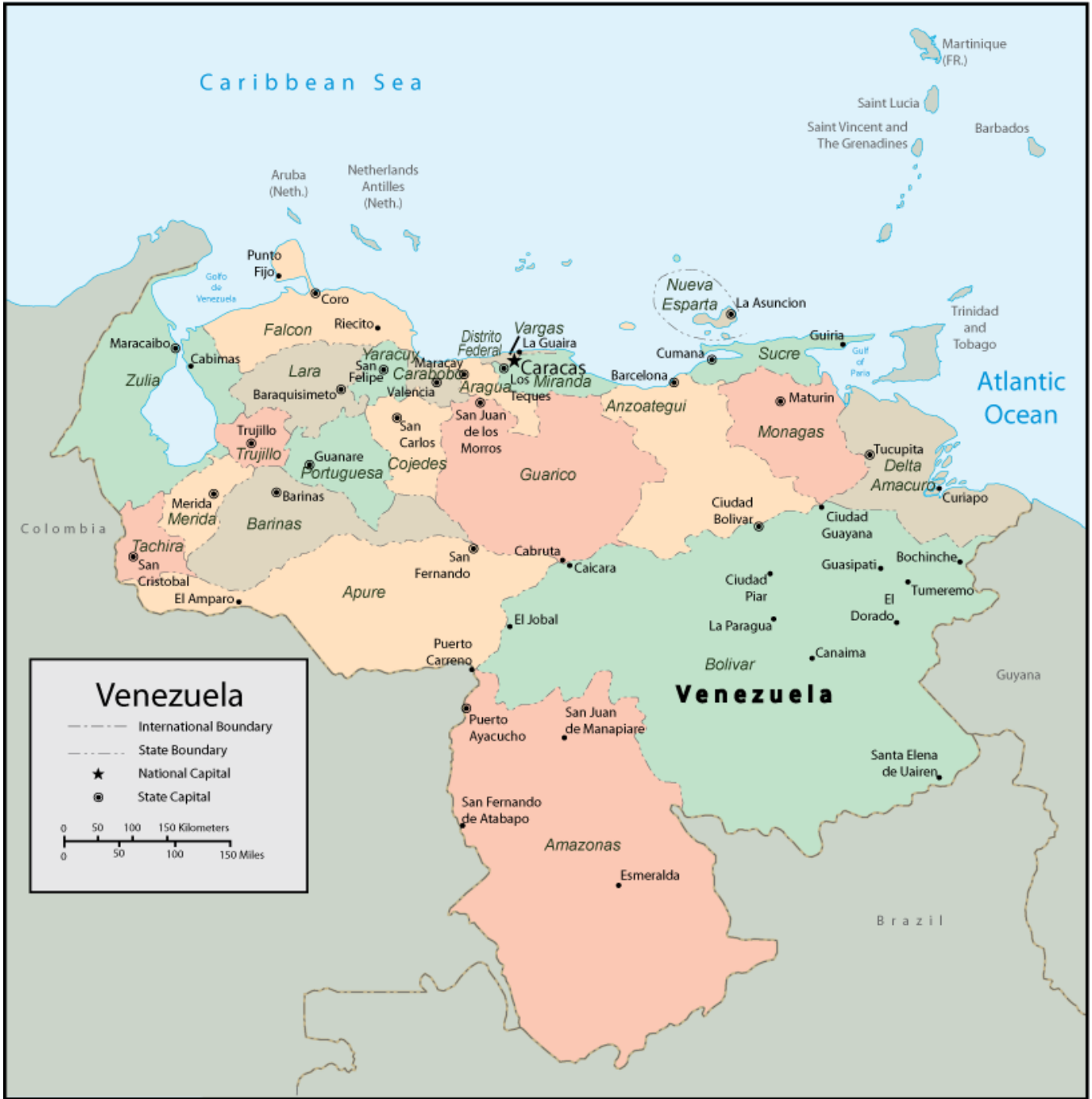
Figure I. Map of Venezuela