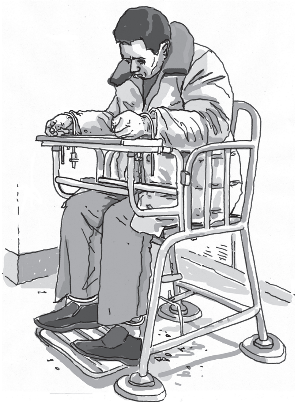
Illustration of a suspect restrained in what the police call an “interrogation chair,” but commonly known as a “tiger chair.” Former detainees and lawyers interviewed say that police often strap suspects into these metal chairs for hours and even days, often depriving them of sleep and food, and immobilizing them until their legs and buttocks are swollen. (c) 2015 Russell Christian for Human Rights Watch