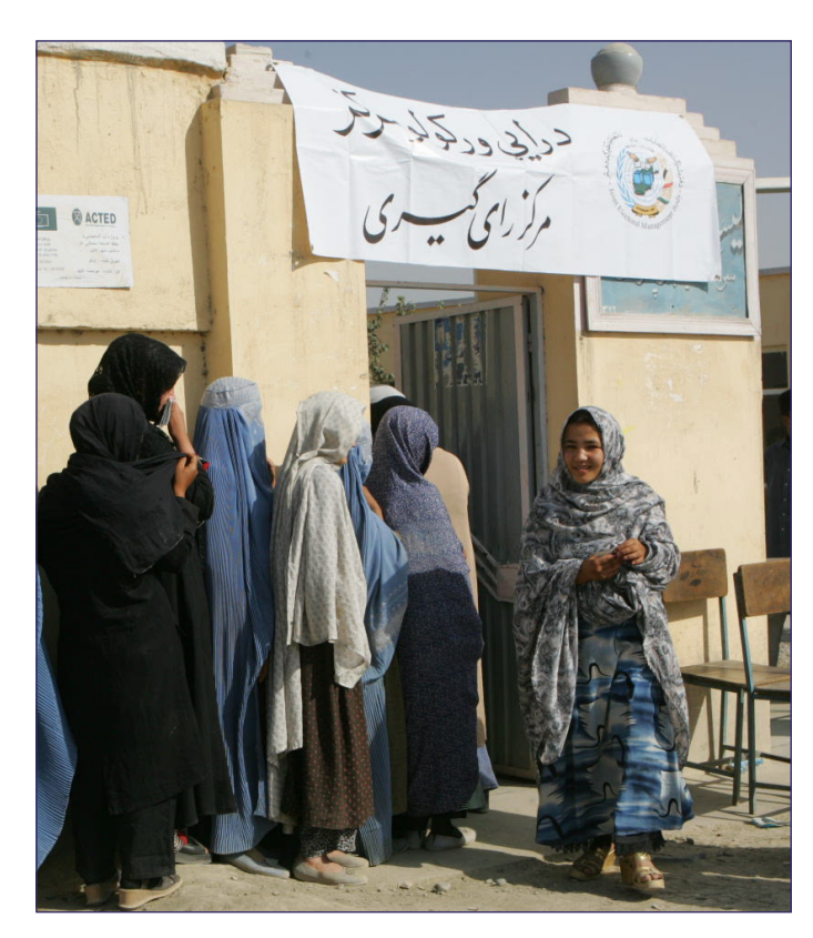
Image 2: Women vote in the 2010 Wolesi Jirga election

However, despite clear improvements in women's awareness of the voting process itself, limits on their ability to access information still placed substantial restrictions on their ability to take part in elections as informed political actors. For many female informants in rural communities especially, knowing how to vote did not necessarily entail knowing whom to vote for. This problem was especially pronounced in Shortepa, where women were most thoroughly excluded from the community's political life. Elsewhere, women's level of engagement also varied with the perceived importance of each election, and whether or not a local candidate was running. While many female informants across study communities were keen to discuss whom they had voted for in the presidential elections, women's discussion parliamentary and PC candidates was largely limited to known figures from their areas. This problem was more pronounced where the PC elections were concerned given the proportionally lower influence of the candidates involved. As one older woman in Yakowlang explained, "I do not