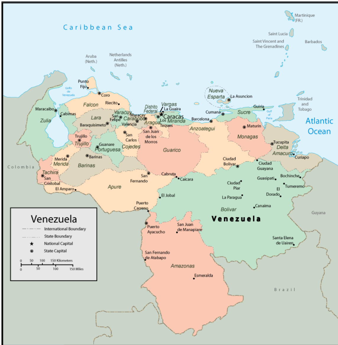
Figure I. Map of Venezuela