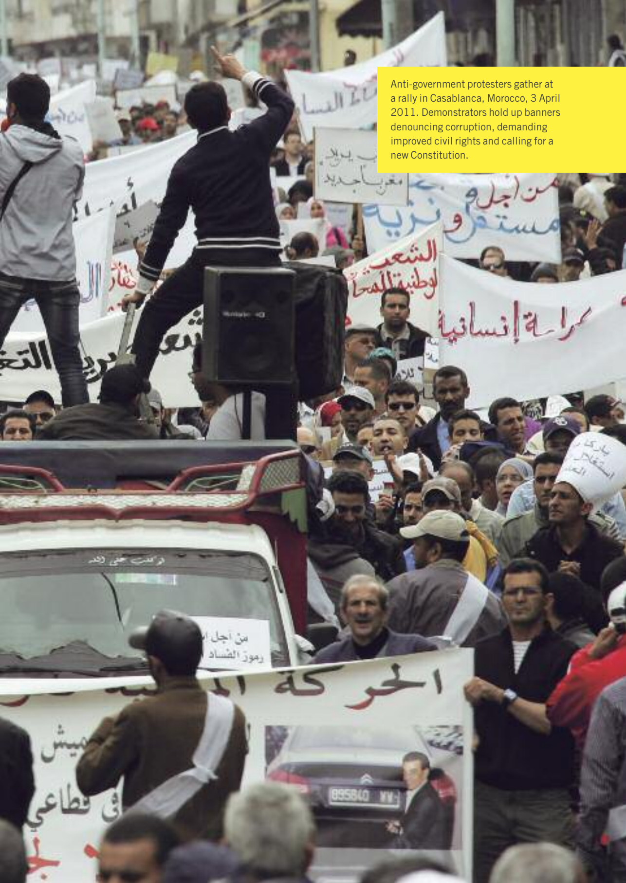
Anti-government protesters gather at a rally in Casablanca, Morocco, 3 April 2011. Demonstrators hold up banners denouncing corruption, demanding improved civil rights and calling for a new Constitution.