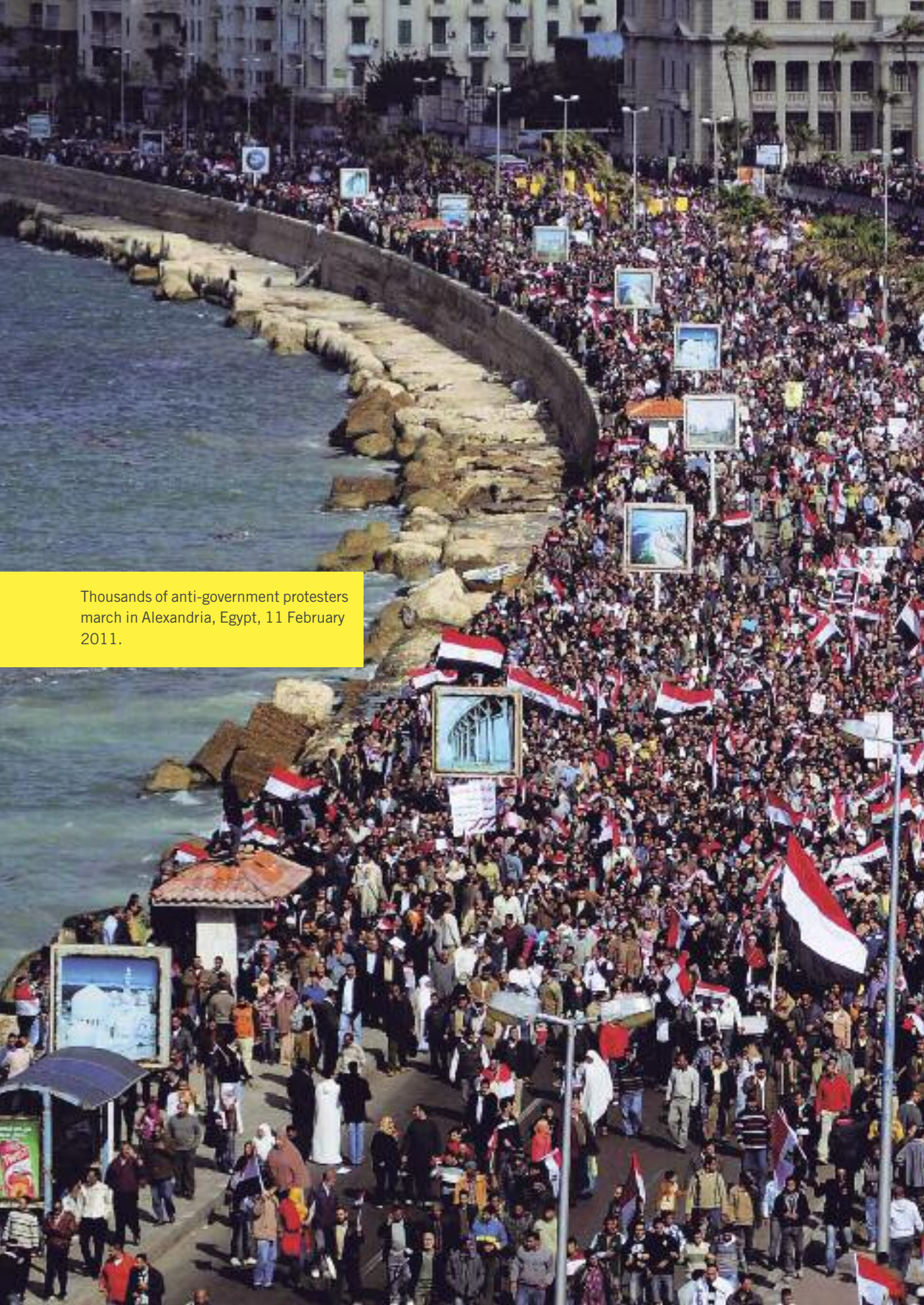
Thousands of anti-government protesters march in Alexandria, Egypt, 11 February 2011.