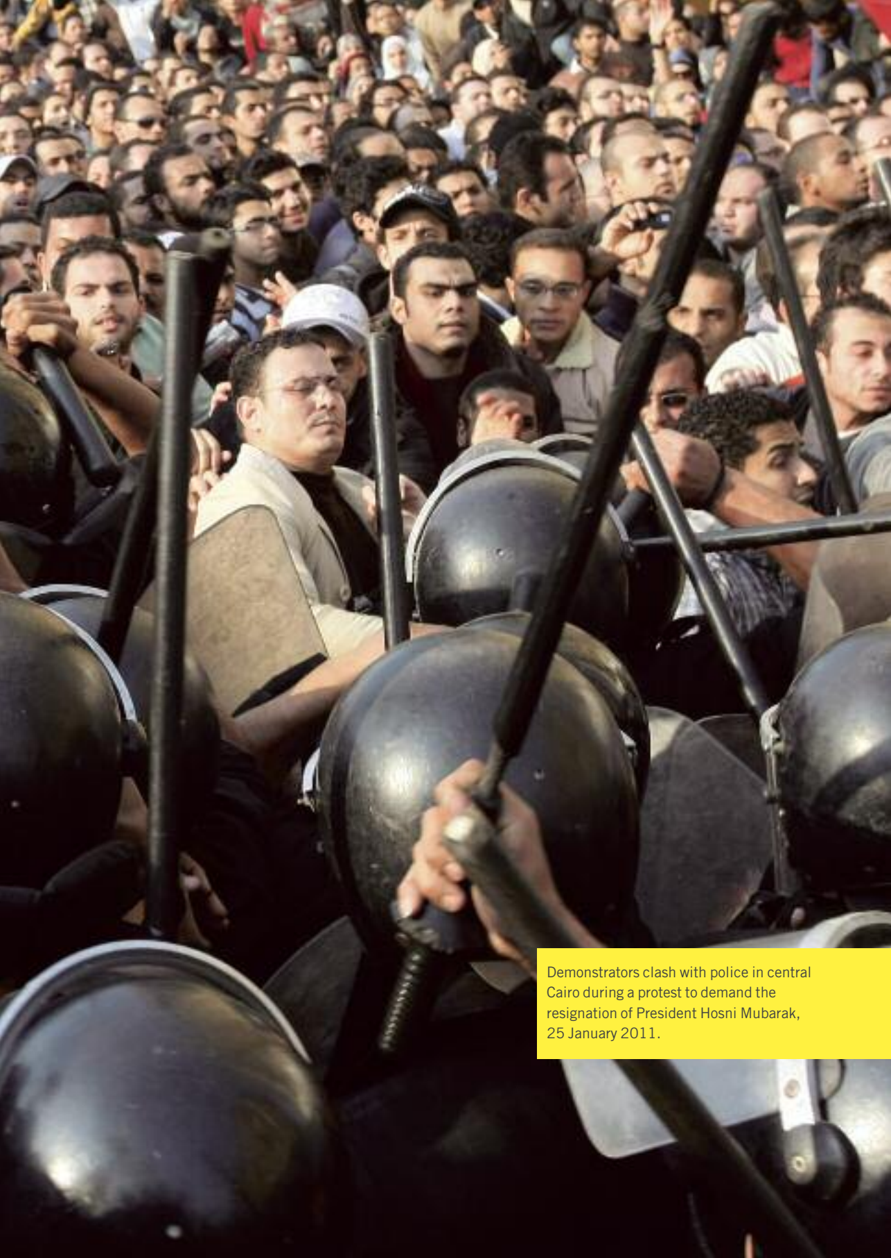
Demonstrators clash with police in central Cairo during a protest to demand the resignation of President Hosni Mubarak, 25 January 2011.