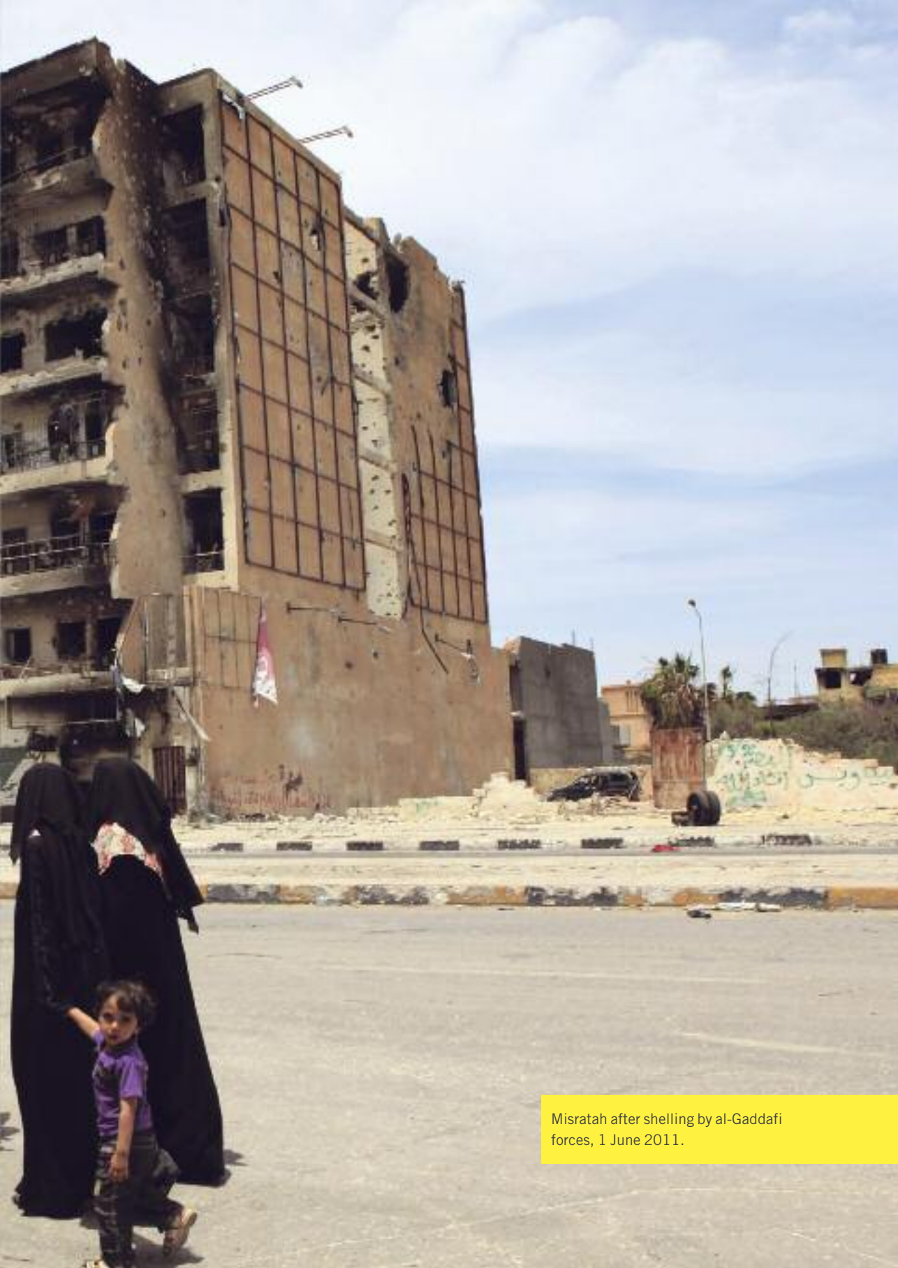
Misratah after shelling by al-Gaddafi forces, 1 June 2011.