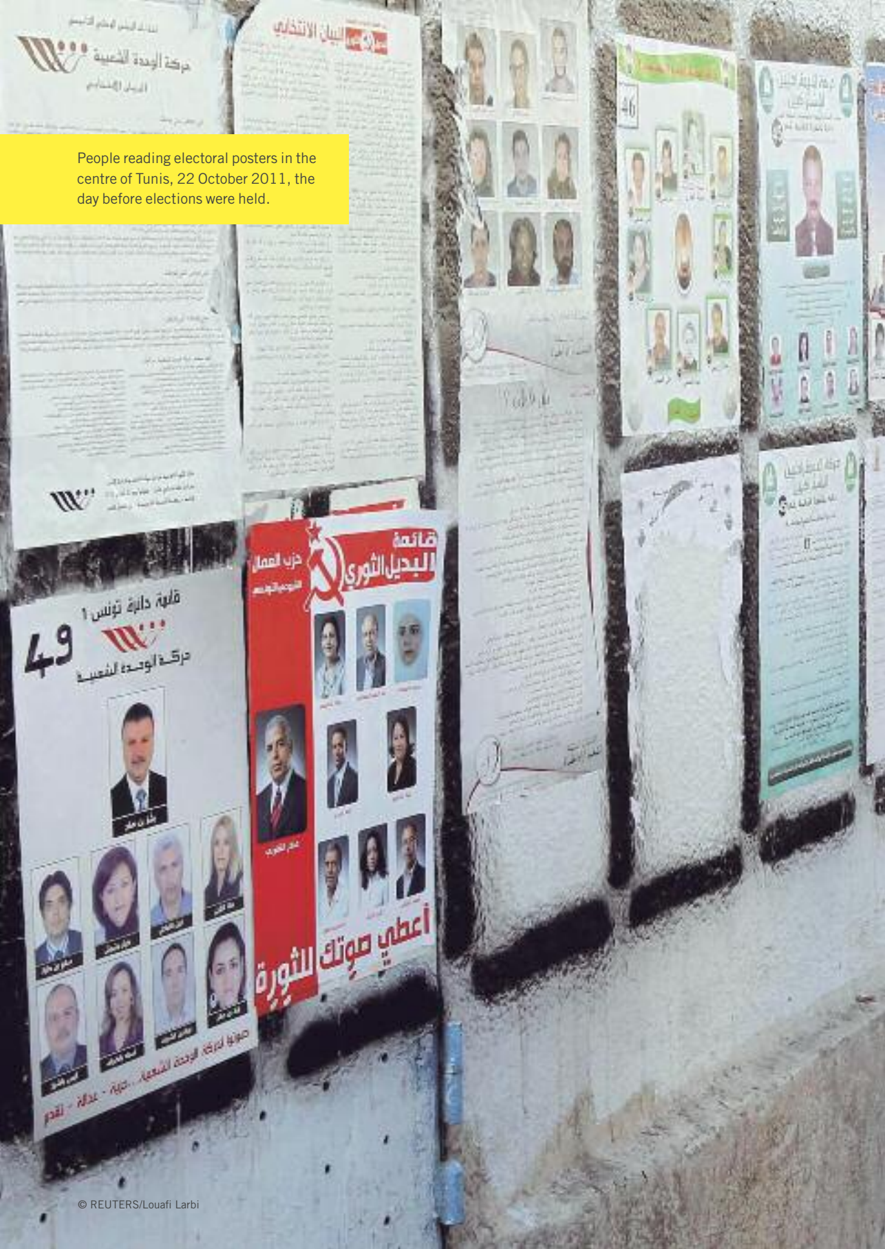
People reading electoral posters in the centre of Tunis, 22 October 2011, the day before elections were held.