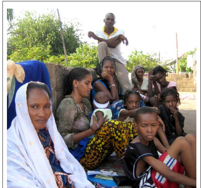
An internally displaced family from northern Mali in Bamako.

According to the latest estimates dating back to 14 January 2013, close to 230,000 people were internally displaced in Mali since January 2012. The overall number of people internally displaced since the beginning of the current military intervention is still unknown. Estimates of those internally displaced are hard to verify because of the conditions on the ground but assessments are currently taking place in accessible regions by humanitarian partners. The year-long turmoil affecting Mali has also forced an estimated 150,000 people to seek shelter and assistance in neighboring countries.