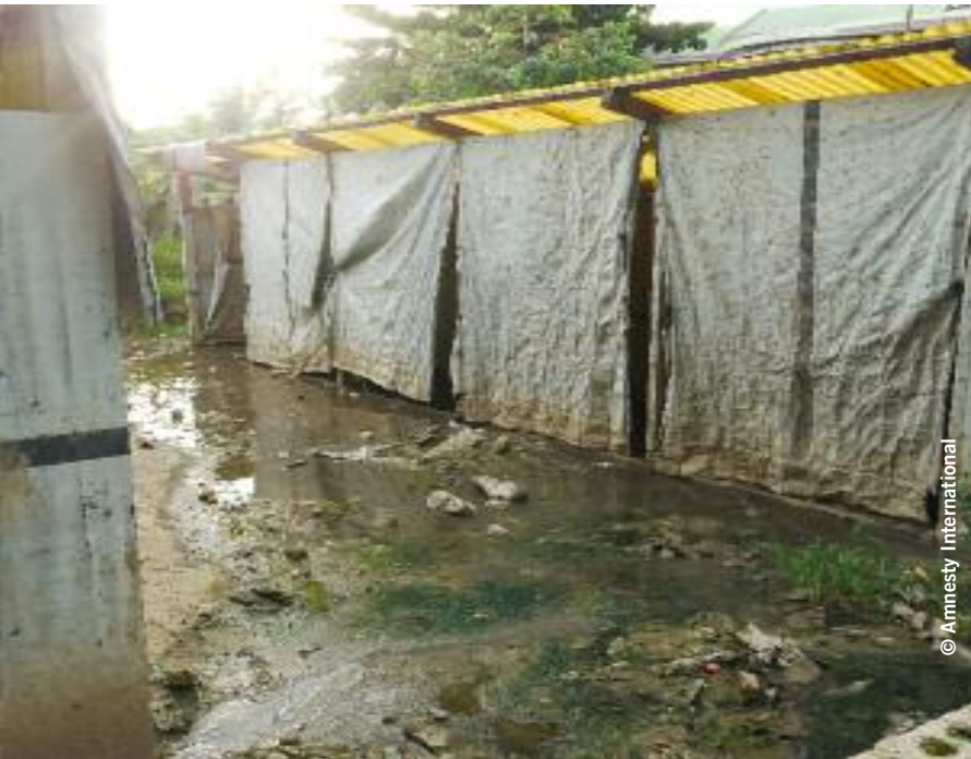
Left: Showers at Camp Grace Village, Carrefour municipality, Port-au-Prince.