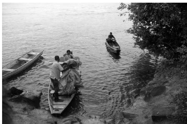
Boat, providing main mode of transport for Micobie community in rural Guyana.

Access to essential medicines varies greatly in Guyana from region to region. In addition to the Amerindians, the majority of the population in the hinterland of Guyana is unable to access medicines, unless they travel to Georgetown or have access to the regional hospitals in Regions Seven or Nine. This often involves long and expensive journeys by foot, boat, road or plane, in a country that has very limited infrastructure linking the interior to the coastal area.