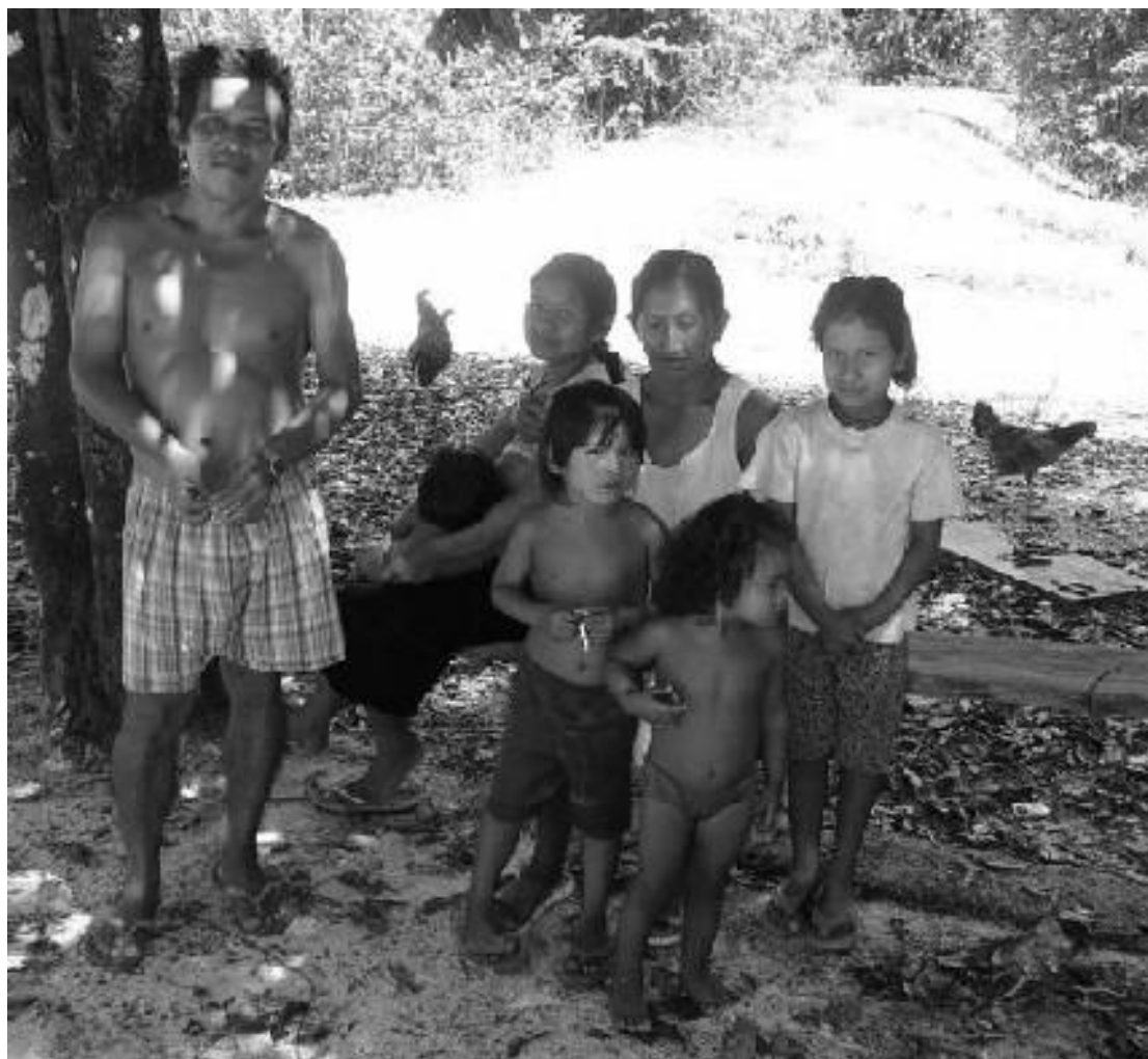
Amerindian family in Guyana.