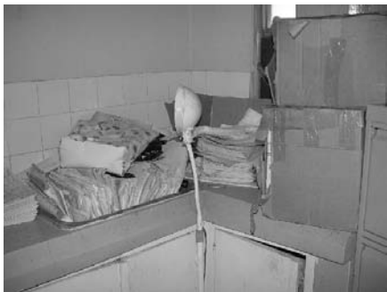
Patient records in a health post (UNAP - primary health care unit) in a batey.

“Everyone knows [the HIV test result] before the patient -- the janitor, other patients, nurses, everyone.”