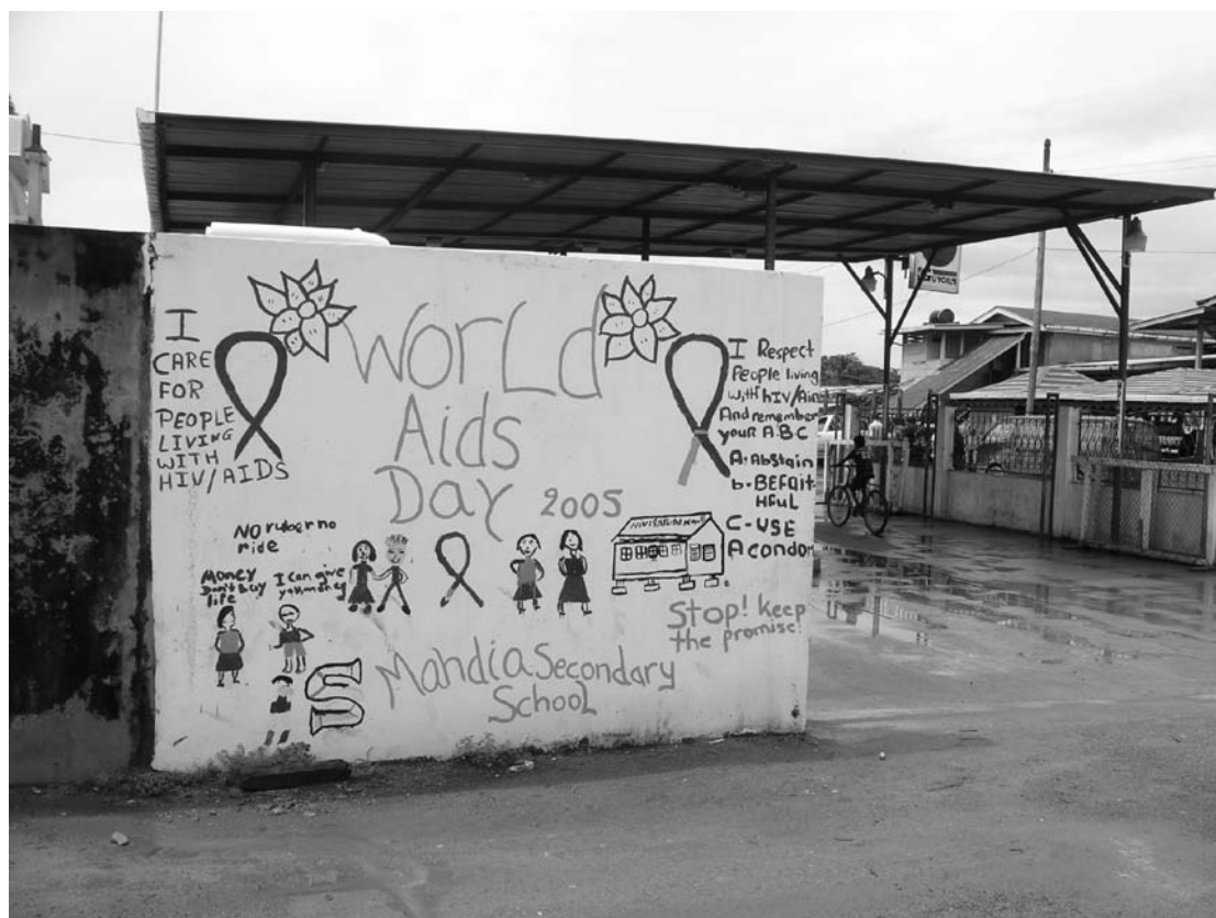
HIV/AIDS Awareness outside a school in Guyana.