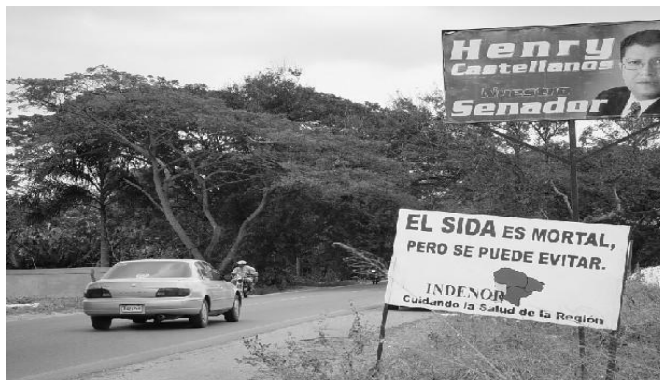
HIV poster on road in Dominican .