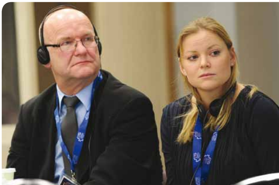
Working group on “Building a gender-sensitive culture and infrastructure in parliament”, Special Session on Gender-Sensitive Parliaments (Quebec City, 25 October 2012).