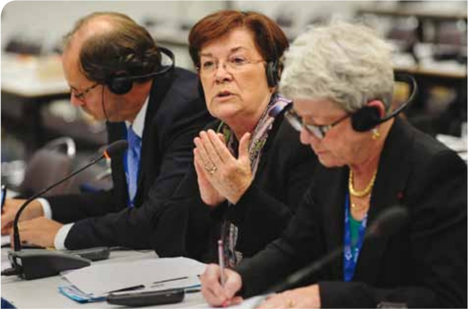
Special Session on Gender-Sensitive Parliaments (Quebec City, 26 October 2012).