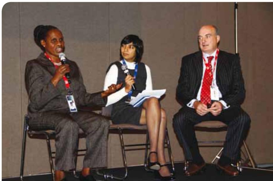
Opening debate with a woman and a man Speakers of parliament on “Transforming parliaments for gender equality”; Special Session on Gender-Sensitive Parliaments (Quebec City, 23 October 2012).