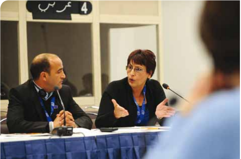
Working Group on “Mainstreaming gender in all of parliament’s work”, Special Session on Gender-sensitive Parliaments (Quebec City, 25 October 2012).