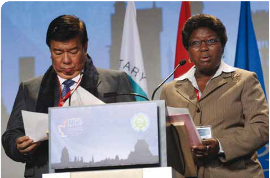
The IPU Gender Partnership Group presents the Plan of Action for Gender-sensitive Parliaments for adoption by the 127 th Assembly (Quebec City, 26 October 2012).

A gender-sensitive parliament is therefore a modern parliament; one that addresses and reflects the equality demands of a modern society. Ultimately, it is a parliament that is more efficient, effective and legitimate.