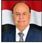
Table I. Yemen Profiles

power to an interim prime minister or vice president. 12 Houthi-Saleh forces reject such a change and have demanded that the United Nations appoint a new special envoy.