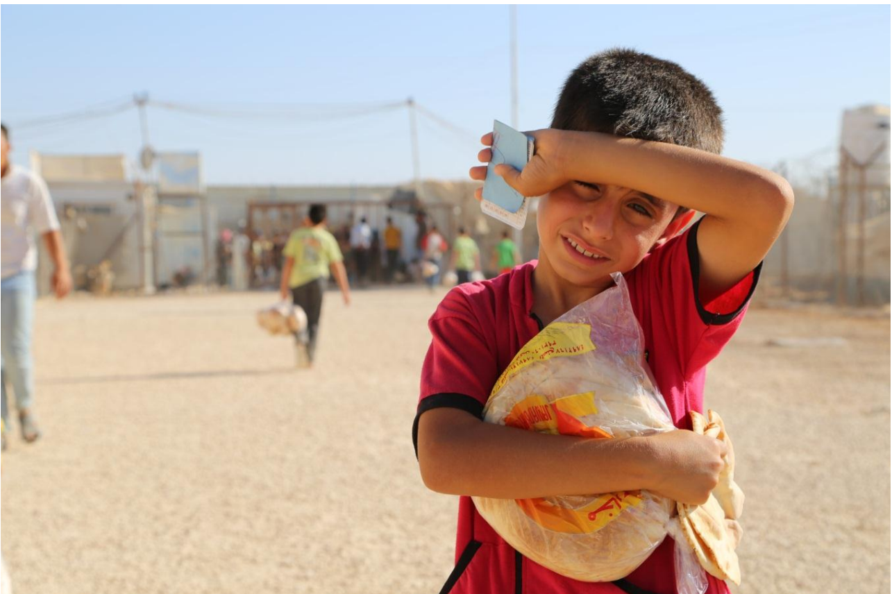
Food distributions in Zaatari Camp, Jordan. WFP