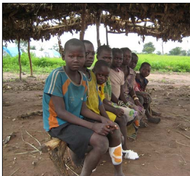
Displaced children in the Kabo IDP site sit in the only temporary classroom still standing after heavy rains in July 2008.

“Internally displaced persons, whether or not their liberty has been restricted, shall be protected in particular against: (a) rape, mutilation, torture, cruel, inhuman or degrading treatment or punishment, and other outrages upon personal dignity.” [Principle 11(2)(a), Guiding Principles on Internal Displacement]