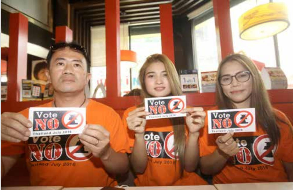
Several members of a campaign group show stickers encouraging people to 'Vote No' to the draft charter near Bangkok's Victory Monument on 14 February 2016.

Thai civil society groups, activists, students, community-based human rights defenders, academics, and media organizations have voiced their collective concern over the draft constitution's content and the restrictions on public debate in the lead-up to the 7 August referendum. 92