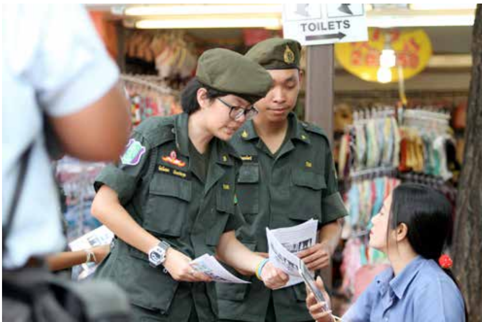
'Ror Dor' army cadets from Wat Nuannoradit School hand out fliers to passers-by at Bangkok's Victory Monument to encourage people to vote in the draft charter referendum.

NCPO-appointed bodies, such as the Constitution Drafting Committee (CDC) and the National Legislative Assembly (NLA), assisted the EC in its effort to disseminate and explain the provisions of the draft charter and the additional referendum question (See below, The trouble with the constitution: Nine major flaws of the draft charter ). In addition, the NCPO enlisted about 100,000 army cadets to encourage eligible voters to participate in the referendum. 77