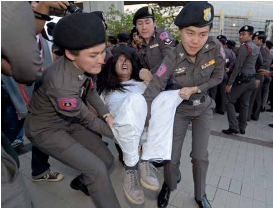
Thai police arrest a student for demonstrating at a shopping mall in Bangkok on 22 May 2015.

Several orders and announcements issued by the NCPO impose severe restrictions on the right to freedom of opinion and expression and the right to freedom of peaceful assembly. Authorities have frequently used NCPO Order 3/2015 to arbitrarily arrest and prosecute individuals who criticized or campaigned against the draft constitution (See below, Restrictions, detentions, one-sided propaganda mar referendum process ).