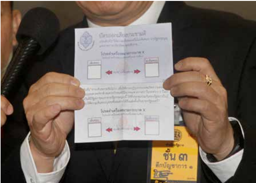
The Election Commission unveils a sample ballot for the referendum set for August.