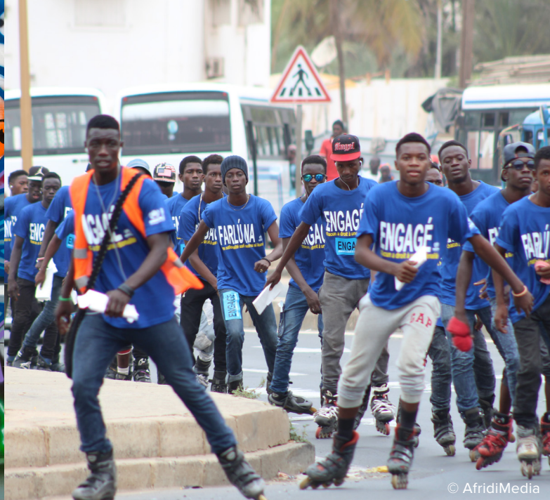
Graffiti art and roller skaters promoting the #IBelong Campaign in Senegal.