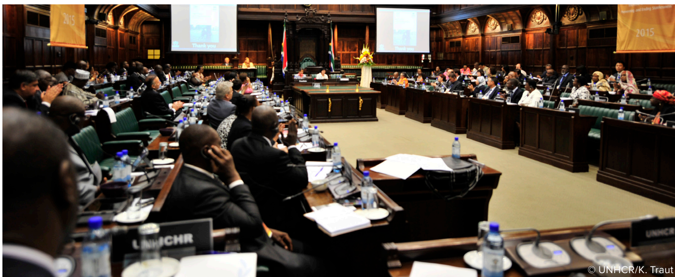
Delegates listen attentively during a session at the IPU – UNHCR conference in Cape Town.

From 30 November to 2 December in Johannesburg, South Africa, Senior Government Officials from Southern African Development Community (SADC) Member States gathered for a workshop jointly organized by International Organization for Migration (IOM), United Nations Office on Drugs and Crime (UNODC), Save the Children and UNHCR. Among the agenda items were the identification of statelessness activities to be included in a SADC roadmap addressing mixed and irregular migration in the region.