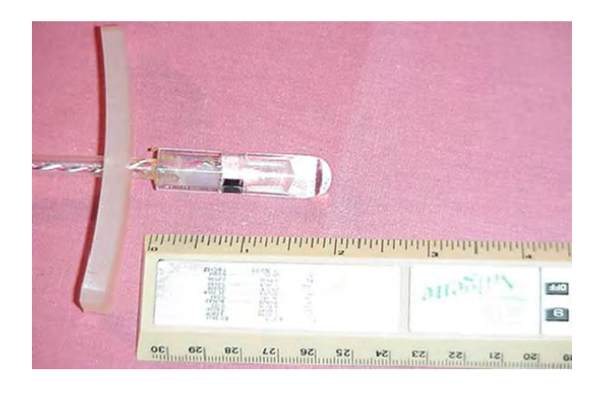
FIGURE D. VAGINAL PHOTOPLETHYSMOGRAPH 111

Comparable in size to a menstrual tampon, the vaginal photoplethysmograph probe is inserted into the vagina, where it emits light. The photoplethysmograph in turns measures the absorption of light by the walls of the vagina, a function of the engorgement of the subject's vaginal walls with blood.