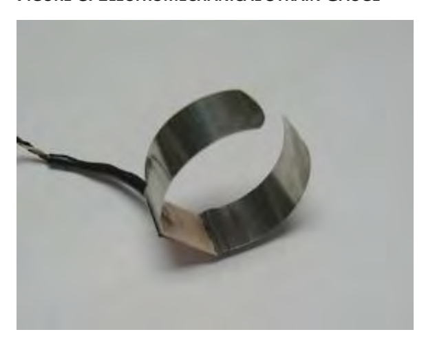
FIGURE C. ELECTROMECHANICAL STRAIN GAUGE<sup>110</sup>

The metal cuff is placed around the subject's penis. Wires attached to the cuff measure changes in electrical resistance as the penis becomes flaccid or erect.