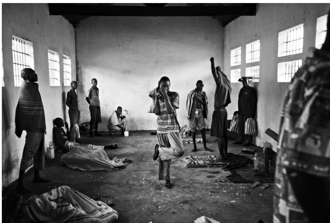
People with suspected mental conditions are routinely detained in prisons. Juba Central Prison, Juba, South Sudan, 2011.

The routine use of prisons to house individuals with mental health conditions is a stark manifestation of the inadequacy of mental health treatment, stigma about mental disorders and the deficit of facilities and trained staff. Individuals with mental health conditions deemed to pose a danger to themselves or others often end up arbitrarily detained in prison, even if they have not committed any crime. They may be transferred to prison from medical facilities or taken directly to prison by family members who feel unable to care for them. In May 2016, there were 66 male and 16 female inmates in Juba Central Prison categorized as mentally ill, more than half of whom had no criminal files. 92 According to a former health worker at Malakal Hospital, prior to the conflict, there were 27 people with mental health problems in the Malakal prison. “Some were brought to prison by family members because they were violent, aggressive, and suicidal,” he explained. 93