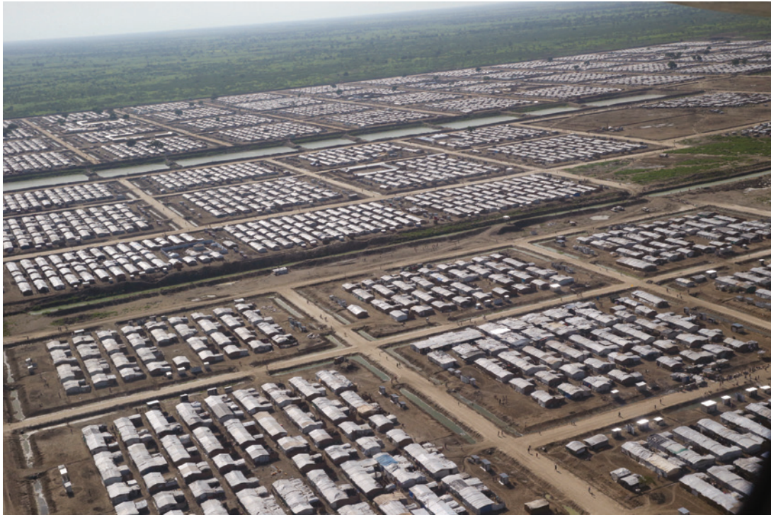
Aerial view of the UNMISS PoC site in Bentiu. June 2016.

Nyawal sought refuge in the Bentiu PoC site in early 2015, escaping an attack on her village in Guit county. She was raped by an SPLA soldier a few months after arriving at the PoC site when she ventured out to buy medicine.