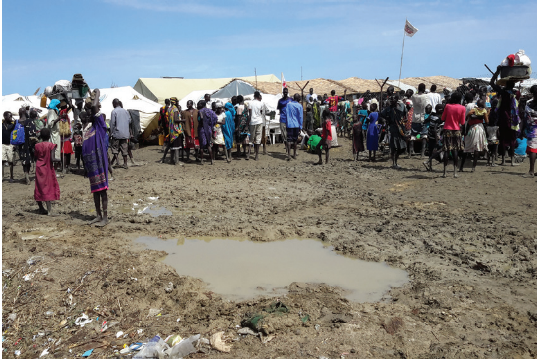
Newly arrived internally displaced people register at UNMISS PoC site in Bentiu, Unity state, May 2015.