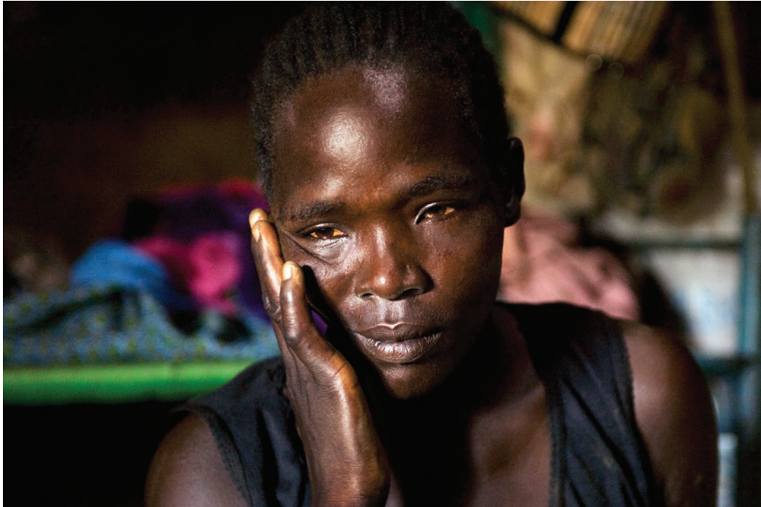
A woman whose husband was killed by an unknown armed group the previous night. Gumbo, Central Equatoria state, 2006