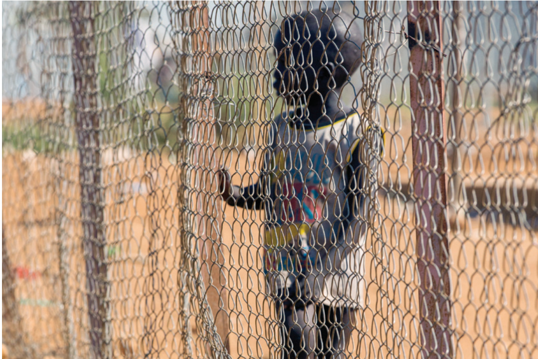
A child at the UNMISS PoC in Juba. 2015

"I am unable to sleep. My wife appears in my dreams. Sometimes she blames me for not performing the required funeral rites...I didn't go to church; I blamed God. When I would go to church I would just cry. My wife used to sing in church. I would remember her voice, how she used to sing."