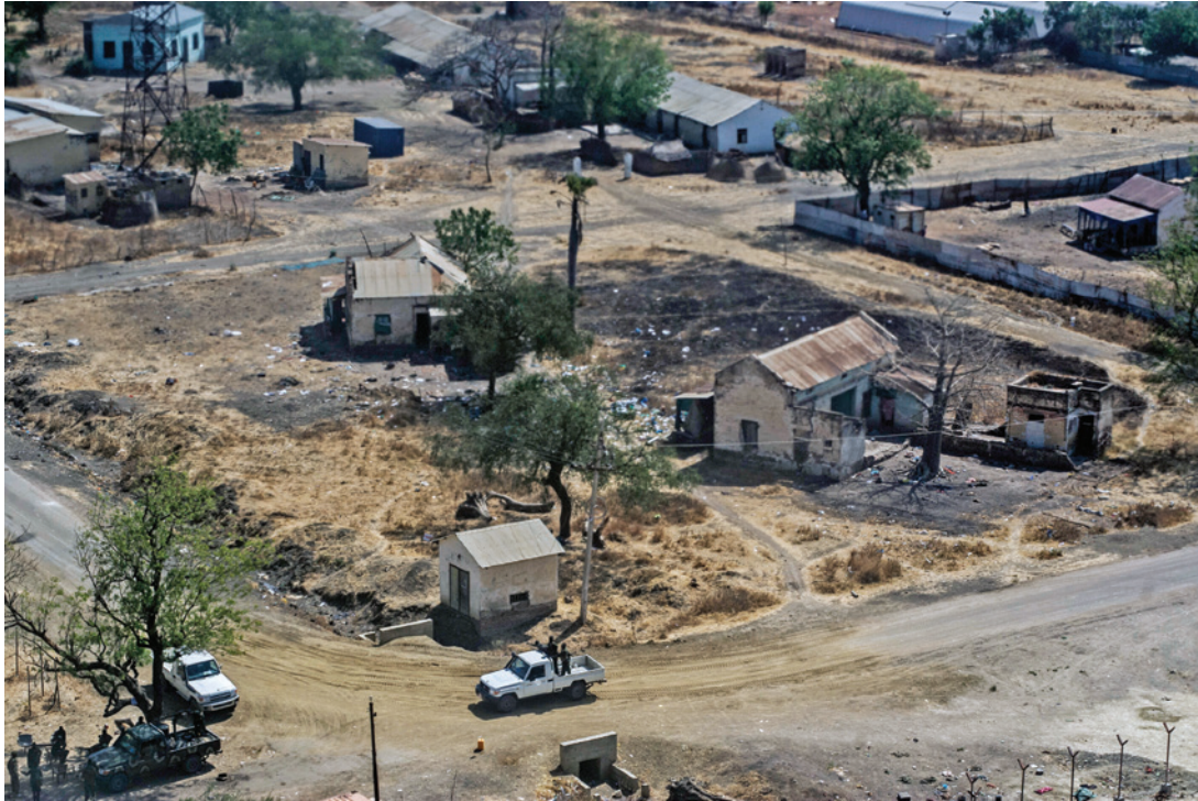
A view of the deserted streets in Malakal, Upper Nile state in January 2014 after residents fled violence between government and opposition forces.

Ajak fled to the Malakal UNMISS base on 25 December 2013, during the first attack on Malakal by opposition forces.