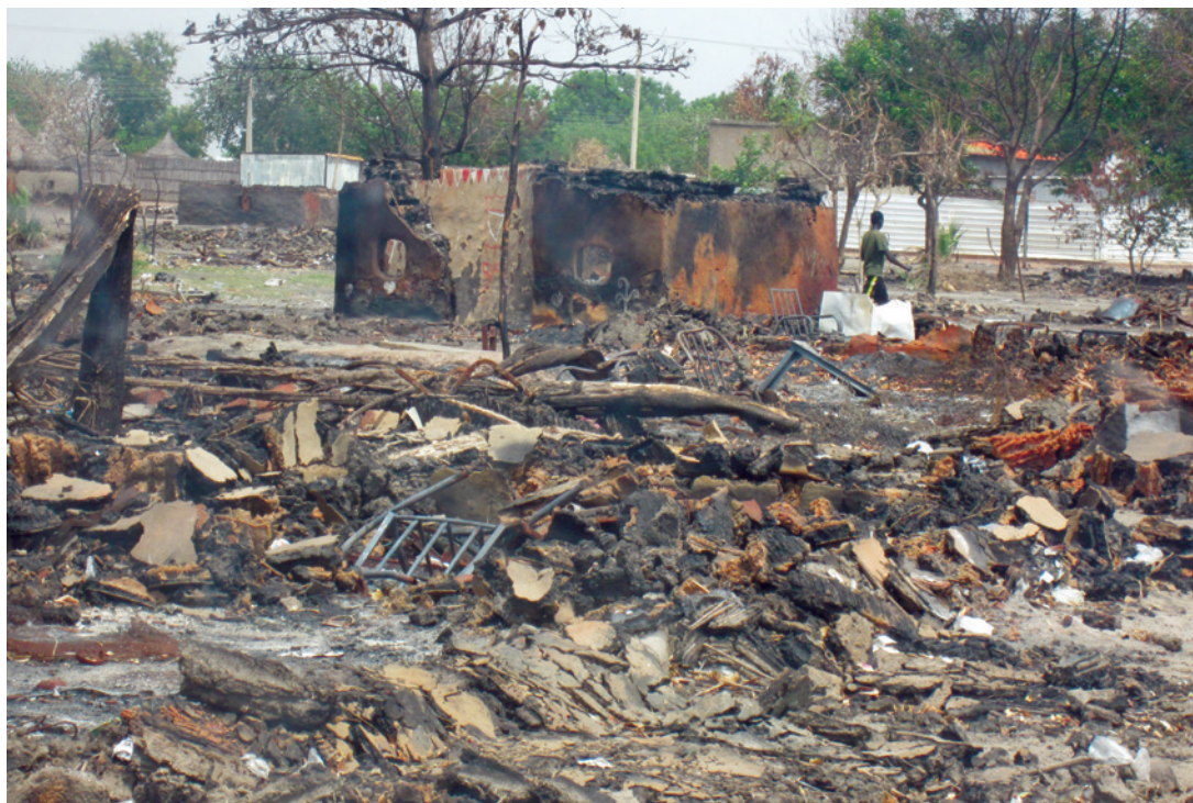
The conflict resulted in the destruction of homes, hospitals, and other buildings. Bentiu, South Sudan, March 2014.

In December 2013, growing political tension between President Salva Kiir and Dr Riek Machar mushroomed into a brutal internal armed conflict. 4 Fighting started in Juba, the capital, where government forces engaged in targeted killings, primarily of Nuer men. Security forces across the country split—with some maintaining allegiance to the government and others defecting to support the armed opposition under Machar, which came to be known as the Sudan People's Liberation Movement/Army-In Opposition (SPLM/A-IO). By the end of 2013, the conflict had engulfed parts of Jonglei, Unity, and Upper Nile states. 5