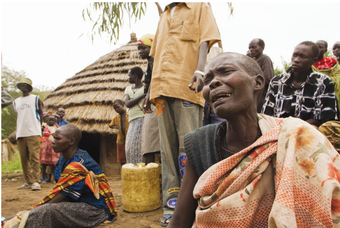
A woman cries following a deadly attack by cattle raiders. Chukudum, Eastern Equatoria state, 2007

The armed conflict that erupted in December 2013 is only the most recent episode of violence in South Sudan's history. From 1956 to 1972 and again from 1983 to 2005, the Government of Sudan and pro-government militias fought against armed groups who sought greater equality and autonomy for the southern regions of Sudan. Both periods of civil war were characterised by extreme violence against civilians, gross human rights abuses, and massive forced displacement. During the second civil war from 1983 to 2005, an estimated 1.9 million people—one out of every five southern Sudanese—were killed or died from disease and famine, and some four million people were internally displaced. 2