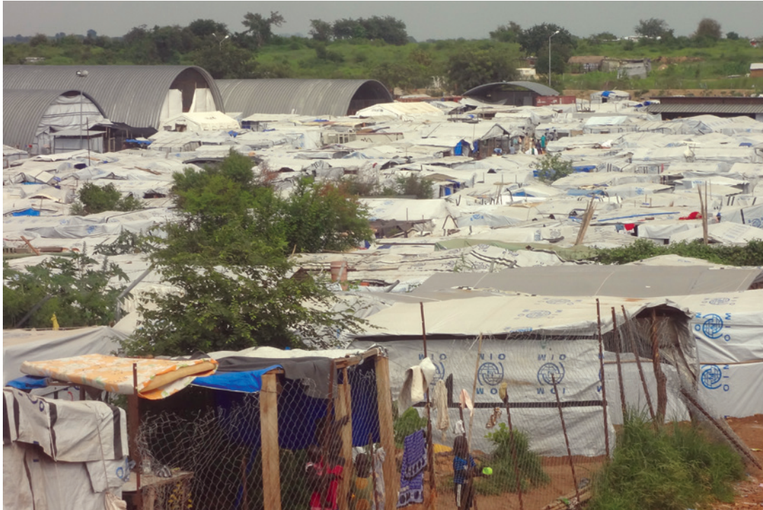
UNMISS PoC site in Juba, South Sudan. 2014

I tried to go to school here but found that I could not concentrate even on the easy things. They just opened a school here, but my thoughts distract me. When I sit still, my mind just goes to other things like my children.”