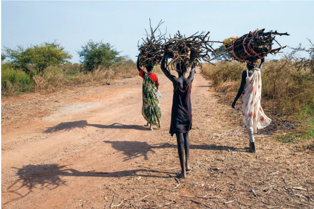
Women returning with collected firewood to the UNMISS PoC site in Bentiu, January 2015.

Nyawal was treated for her rape by Médecins Sans Frontières (MSF) and also received support from the International Rescue Committee (IRC), which provides counselling for survivors of sexual violence in the Bentiu PoC. Her experience caused her significant mental anguish.