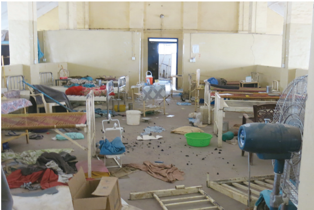
A ward in Malakal Teaching Hospital, where patients and displaced people who had taken refuge were killed by opposition forces in late February 2014. Malakal, Upper Nile state, March 2014.

“She can't manage—she's not normal. She can talk but it's senseless. She quarrels with the children. She cooks, but like a child, she burns things. She knows the children's names, but she does not know their ages. It is the children who tell her to do the things she should do. She can't identify what is happening...Sometimes I pray to God to help her.” 51