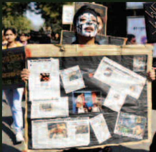
Students protest arrests of civil society activists in Delhi in January 2011.

In recent years, the Maoist movement has gained support because of land acquisition for infrastructure and mining that is displacing and harming communities. Corruption in public services means that the government has frequently failed to deliver on development initiatives. Due to these factors, some activists are in fact ideological supporters of the Maoists. Where this support violates the law, as when individuals deliberately provide information or assistance that aids and abets Maoist attacks or other criminal activity, the authorities have a responsibility to arrest and prosecute them in accordance with due process standards. However, the authorities should act only when they have specific credible evidence that an individual has engaged in criminal acts and never on blanket assumptions that activists who criticize the authorities or have contact with Maoists, are criminally abetting Maoist crimes.