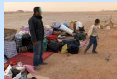
Father and son at the Iraqi / Jordanian border

Governorate. One initiative will be the screening of a video to show conditions at the Erbil settlement which UNHCR prepared in March. A second initiative is the possibility of the KRG authorities accompanying UNHCR to the Iraqi-Jordanian border to demonstrate their support and commitment to helping the refugees to relocate.