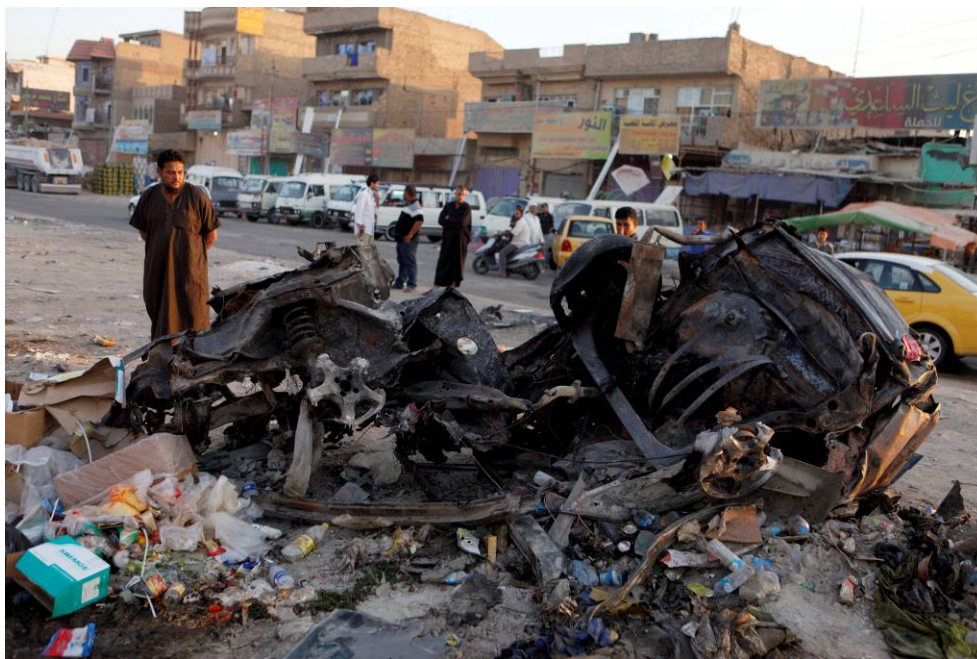
People inspect the aftermath of a car bomb attack that killed several people in Baghdad's Shi'a neighbourhood of Sadr City in mid-August 2012, the end of Ramadhan. The incident occurred in the context of a wave of bombings and armed attacks that caused the deaths of more than 100 people throughout the country.

internally displaced within their own country and hundreds of thousands more to flee as refugees to neighbouring states, particularly Syria and Jordan.