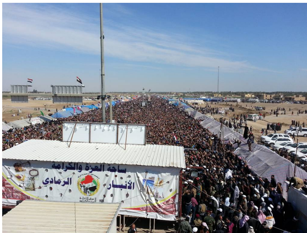
Thousands of protesters in Ramadi, Anbar province, two months after demonstrations began, 22 February 2013.

The demonstrations began in the second half of December in the pre-dominantly Sunni province of Anbar, following the arrest by security forces of several bodyguards of Finance Minister Rafi'e al-Issawi, a senior Sunni political leader. These new arrests followed others in December 2011 when dozens of bodyguards and others associated with the then Vice-President, Tariq al-Hashemi, another leading Sunni politician, were detained amid government allegations that he had organized death squads and ordered killings. He was charged under the Anti-Terrorism Law, Law 13 of 2005, and tried in his absence at several separate trials, convicted and sentenced to death.