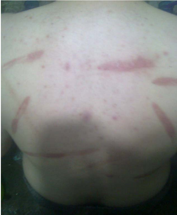
Traces of beating on the body of a detainee, reportedly inflicted by officers at a detention centre in Ramadi in about April 2012.

In July 2012, while still in custody, he filed a formal complaint against the security officials he accuses of torturing him. The KRG authorities, however, appear to have taken no action in response to this complaint and in February 2013 the alleged torturers were believed to remain in their posts and on active duty.