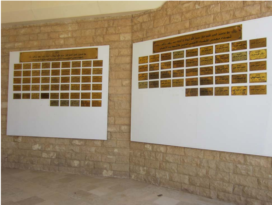
Plaques in memory of scores of judges and prosecutors who have been killed in attacks over the past decade in Iraq, fixed to the wall at the entrance of a judicial building, Baghdad, September 2012.

The executive branch of government, through its actions, has continued to directly undermine key rights, such as the right to fair trial – for example, by allowing terrorism suspects' “confessions” to be broadcast on television even before those suspects come to trial. In some cases, senior government leaders have publicly pronounced individuals' “guilt” to capital charges either before they have been tried or before their trials have concluded.