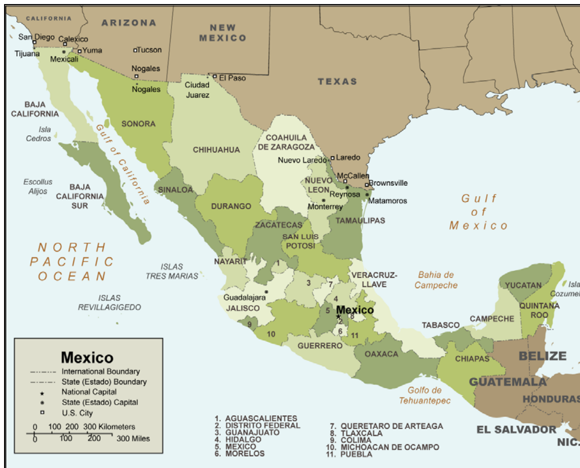
Figure I. Map of Mexico, Including States and Border Cities

Over the past decade, Mexico has transitioned from a centralized political system dominated by the Institutional Revolutionary Party (PRI) to a multiparty democracy in which presidential power is increasingly constrained by Congress, the Supreme Court, and the country's governors. 1 President Felipe Calderón of the conservative National Action Party (PAN) won the July 2006 presidential election in an extremely tight race, defeating Andrés Manuel López Obrador of the leftist Party of the Democratic Revolution (PRD) by fewer than 234,000 votes. President Calderón began his six-year term on December 1, 2006. He is to be succeeded by Enrique Peña Nieto of the PRI, whom Mexico's Electoral Tribunal recently certified as the victor in Mexico's July 1, 2012, presidential elections. President-elect Peña Nieto is scheduled to take office on December 1, 2012.